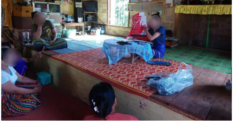
The volunteer was explaining safe migration during goods distribution

In 2020, AAT supported the works of volunteers to distribute goods for the beneficiaries affected by COVID-19. The volunteers interviewed the target groups who returned from China, as well as explaining to them human trafficking for sexual exploitation and safe migration.