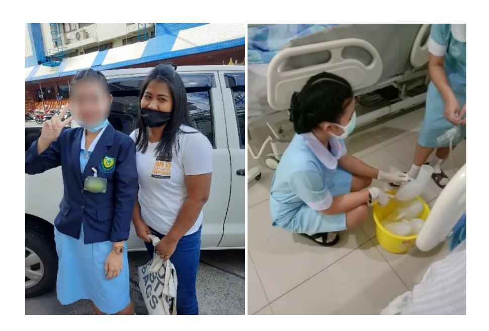
The beneficiary was supported for studying in nurse assistance school.

beneficiary who would like to apply for nurse assistance school but is not eligible as the school requires the applicant to have at least grade 9. Now she is studying hard to achieve grade 9 so that she can apply to nurse assistance school.