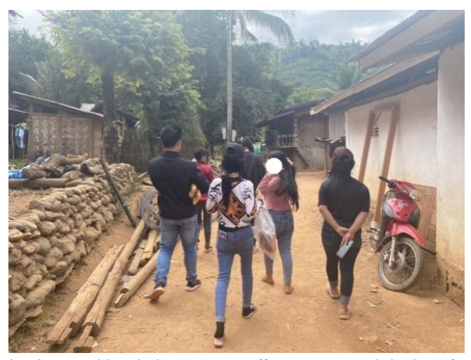
After leaving the disguised brothel, AAT Lao staffs accompanied the beneficiaries to home