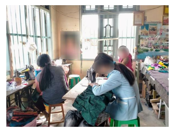
The beneficiary wearing a blue shirt training in the sewing school.