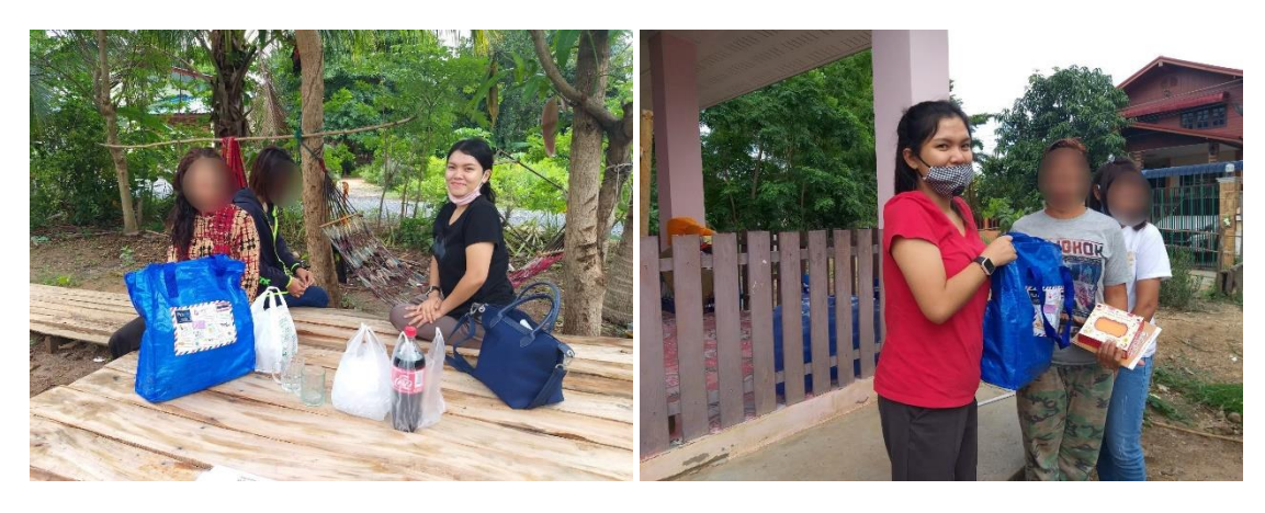
The social worker giving necessity bags to the target groups who particularly affected by COVID-19.

In the early to mid 2020, AAT field works were particularly affected by COVID-19, namely the team could not travel to other provinces in order to conduct field activities or provide physical follow-up services for the beneficiaries who were repatriated to their community. Therefore, we trained Agents of Change who were already in the field so that they can provide services in their communities. The Agents of Change first collected data of target groups in prostitution or at risk to be in prostitution due to COVID 19. After having located them, Agents of Change provided visits, distributed necessary supplies to their peers and their families who live nearby. Furthermore, Agents of Change helped finding families who needed to develop income-generating micro-projects and helped to evaluate the market conditions. Finally with the help of the Agents of Change, we provided support and follow-up to these families to realize their micro-projects as preventive measures.