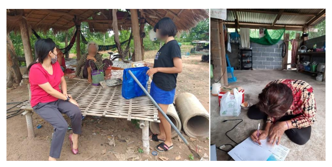
The empowerment team visits the beneficiaries in their community in order to follow up and advise about career alternative programme.

struggling with the family situation such as economic problems. Some of them could not generate income so we advised them and their families about career alternatives and educational opportunities. We also provided necessary kits to the victims and families. After receiving a small grant, most of the victims started their own business for instance selling fried food and selling online products.