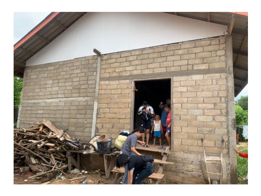
AAT Lao staff together with Agent of Change provided follow-up service and met with beneficiary's family