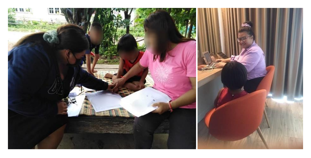
The legal officer discussing with victim's family and preparing the victim to testify at the trial.

For victim empowerment, we respect the decision of the victim whether to report the case to the police or to proceed to prosecution. Some of the victims may be discouraged to take the legal processes. We empower them to recognize their rights and inform them that they are entitled to remedy and compensation.