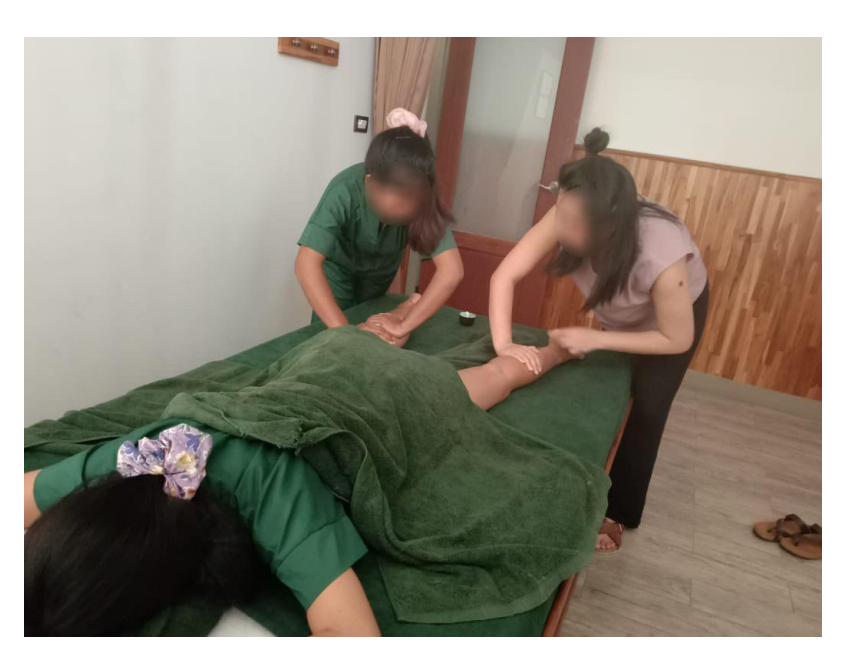
The beneficiary (green shirt providing massage) started a new job at a massage shop, a member of AAT local businesses network