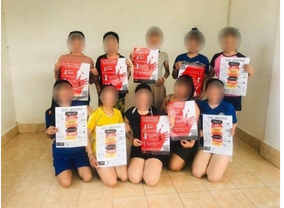
Group consultation on human trafficking and safe migration

Agents of Change play a crucial role to detect and reach out to the underrepresented target groups. We supported the Agents of Change to conduct focus groups with their peers who are providing sex service. The activity aimed to encourage the target groups to leave prostitution and orient them to career alternatives. There were 6 target groups that joined the activity. Among the 6 target groups, 2 target groups decided to stop providing sex services.