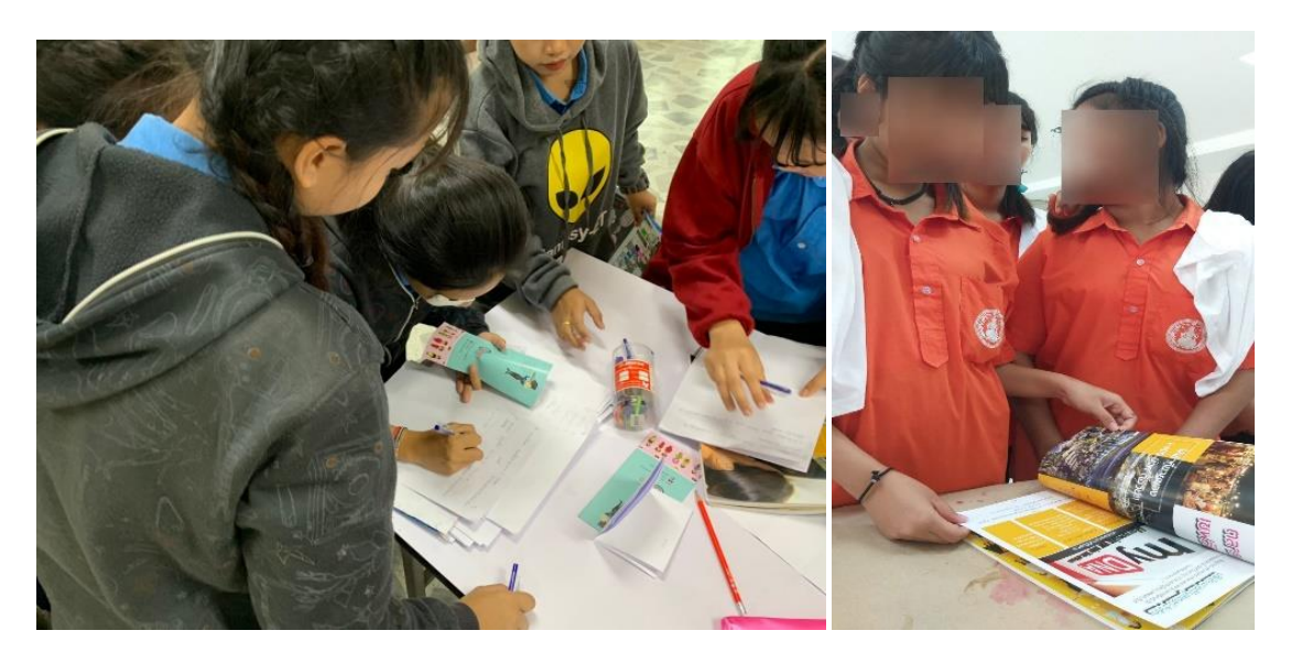
The victims applying for the career alternative programme.