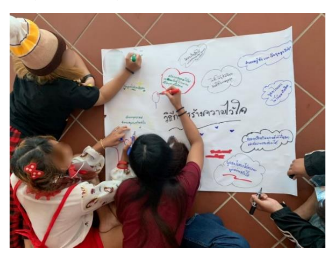
Agents of Change were trained about effective communication and case notification.

In Agent Of Change capacity building programmes the "Peer-To-Peer" approach is adapted to our strategy in order to build the capacity of former victims to become "Agents of Change". The Agents of Change are able to reach more target groups as the target groups are more able to reach victims and at-risk groups because the Agents of Change are close to them.