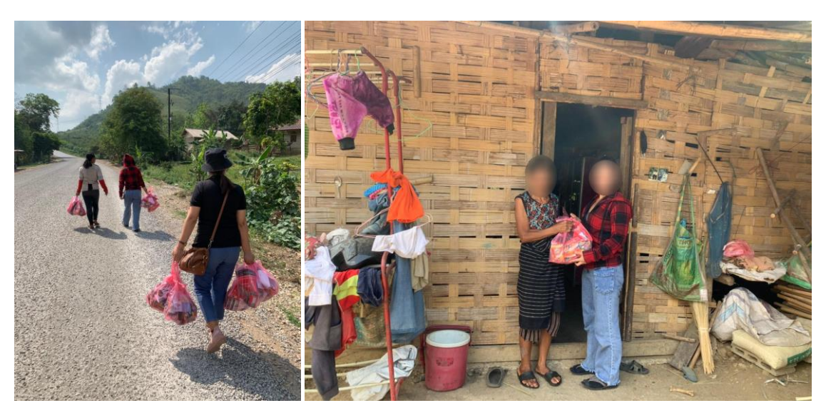
The Agent of Change and the volunteers were distributing goods for the beneficiaries who affected by COVID-19.

In 2020, AAT supported Agents of Change and volunteers to undertake COVID-19 relief assistance in Vientiane province, Laos. During the activities, Agent of Change and volunteers advised the beneficiaries about protection from human trafficking for sexual exploitation, safe migration, and case notification channels.