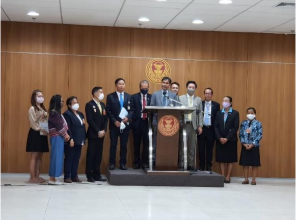
At the parliament, AAT together with Anti-human trafficking advocates were giving a statement about the Victoria Case.