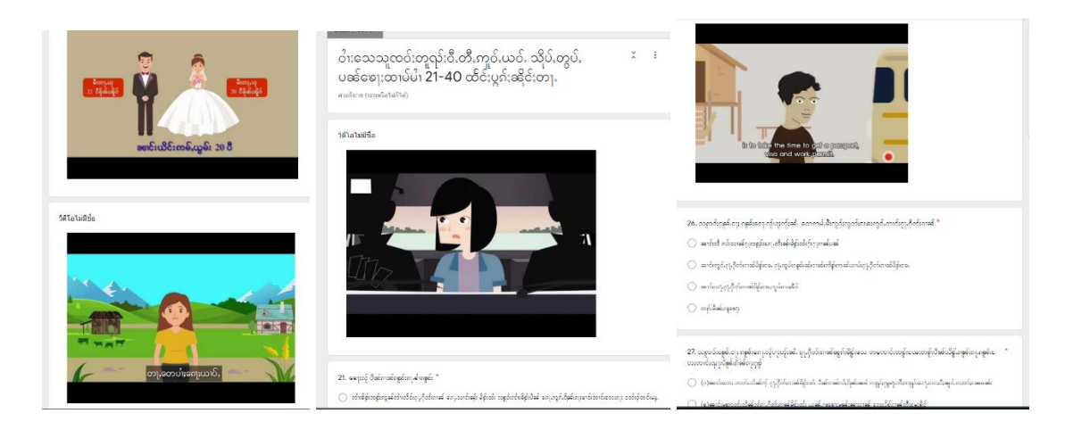
The online questionnaires for human trafficking and safe migration

A total of 689 beneficiaries received information about human trafficking and safe migration.