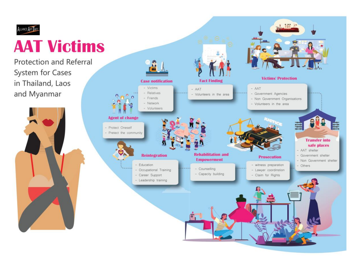
The infographic explaining the full protection and prevention process of AAT.

The current report covers actions during 2020 in Thailand, Laos, and Shan State only, as well as actions to protect Thai, Lao, and Burmese victims trafficked/forced married overseas.