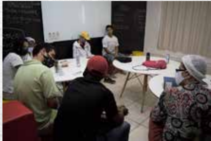
Classroom activities following all safety guidelines from health agencies