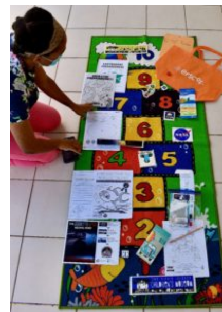
Discovery Kit items on display (Submitted photo)

Financial support is needed to keep the At Home Discovery Kit Program going and growing. Charitable donations can be made by mail or through the donation button found on the Virgin Islands Children's Museum website www.vichildrensmuseum.org .