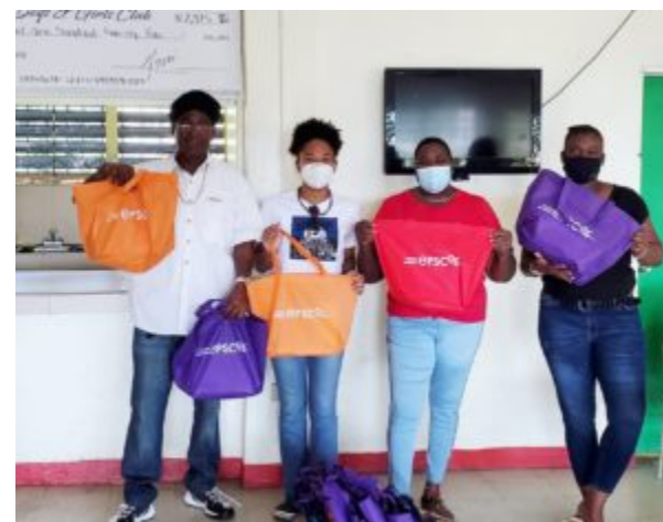
The Virgin Islands Children's Museum delivers Discovery Kits.