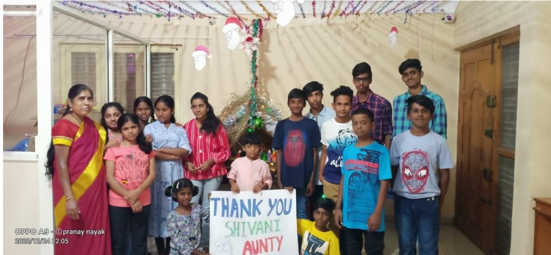
OPPO A9 • ©pranay nayak 2020/12/24 22:05