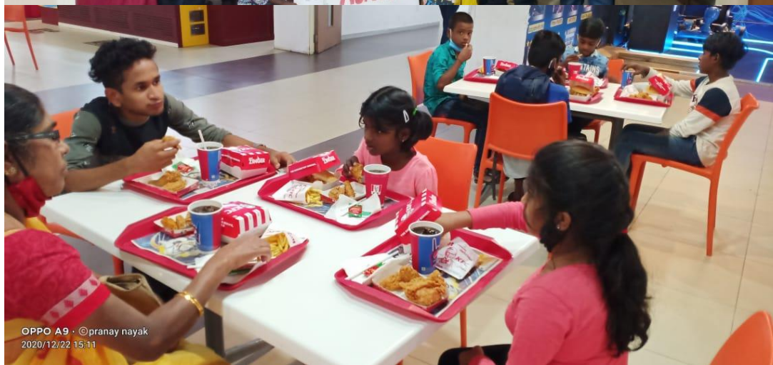
OPPO A9 • ©pranay nayak 2020/12/22 15:11