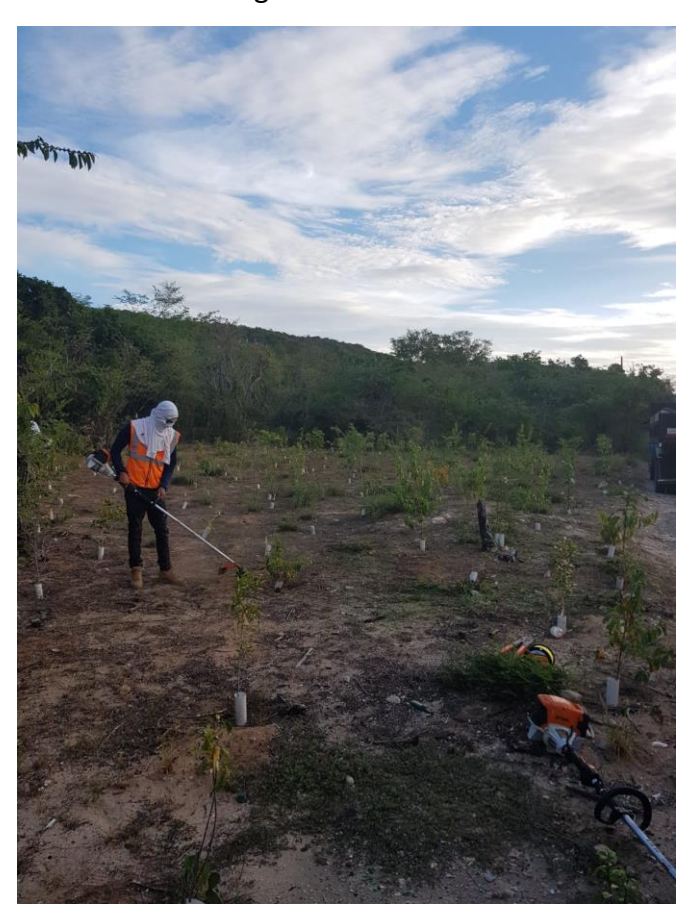
Figure 7. PDC staff trimming surrounding areas of planted trees.

Healthy growth of native trees planted has been observed in all of the reforested areas. Irrigation takes place on a weekly or biweekly basis, depending on the weather conditions and rain events. Maintenance includes the removal of invasive grass species, the trimming of the surrounding areas and removal of dry or dead portions. Maintenance visits are programmed to continue for several months to ensure the success of the reforested trees.