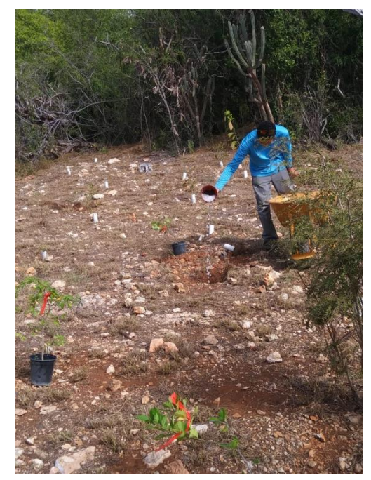
Figure 5. Adding granular polymer to help reduce plant watering.

A granular polymer was added as a soil amendment to help reduce plant watering (Figure 5). The use of this polymer not only retains water but also helps reduce transplant shock and soil compaction. Fertilizer was added inside the holes and once the tree was planted, it was covered with the soil previously extracted from the hole leaving at least one (1) inch of space before reaching the ground level for water retention