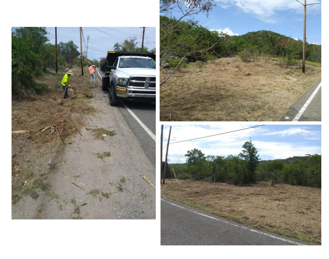
Figure 3. Eradication of invasive grasses along Road 333 in the GDF.