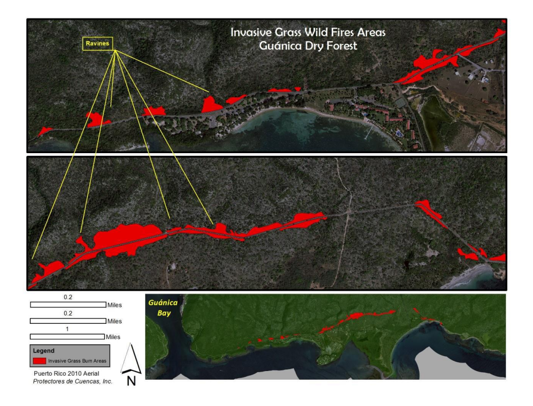
Figure 1. Map of extension of invasive grass wildifire areas. Common burn areas are highlighted in red.

The geographic extent of the affected area includes 25 acres of target forest patches across the southern-most GDF boundary along Road 333. Through this project, PDC completed the eradication of grasses and reforestation of 3 acres of the 25 acres currently being affected by fires. A closed canopy of native tree species will help prevent the recolonization of invasive grass species in its place.