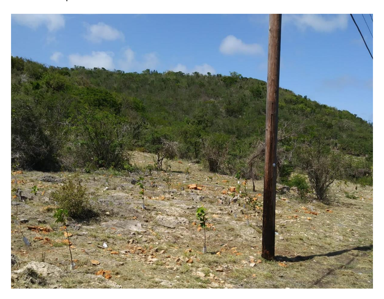
Figure 6. Reforestation site along Road 333

purposes. All trees were watered the same day they were planted. Finally, a piece of 4-5-inch PVC pipe was placed at the base of each planted tree to protect them during the maintenance period.