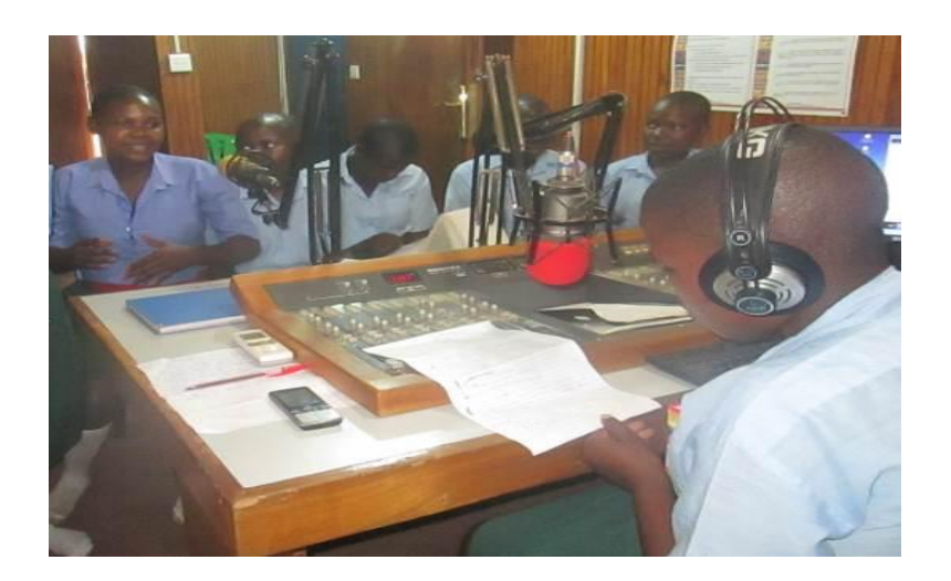
Students of different schools sensitize the communities on radio on girl child education

The institution organized 22 radio programs through partnership with a community radio station to educate the rural listeners on a broad range of topics tailored on youth and women empowerment, girl child education and the importance of vocational skills training. The listeners who called in appreciated the importance of life skill and vocational training and also the relationship between Health and home development, how to prevent HIV and AIDS. Also as a result, the participating students developed confidence and ability to generate ideas and related actions concerning the different topics to over 1.5 million listeners. Also it enabled youth and listeners to gain knowledge and skills on how to identify and handle different forms of sickness especially where there is no doctor so that one can give first aid.