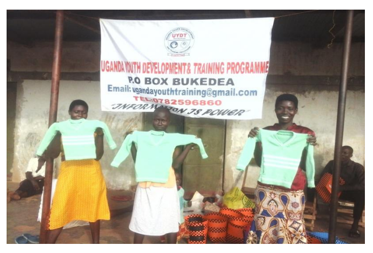
Girls display the sweaters they made during the training