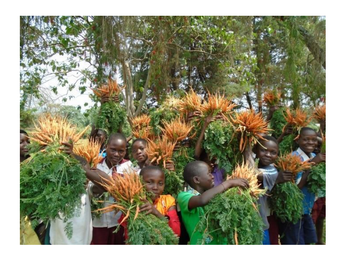
Pupils display the carrots harvested from their farm