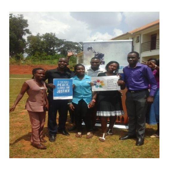
Youth who attended a workshop on peace building