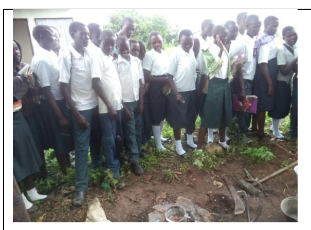
A student raising a hand to ask question as other students watch during saucepan making training