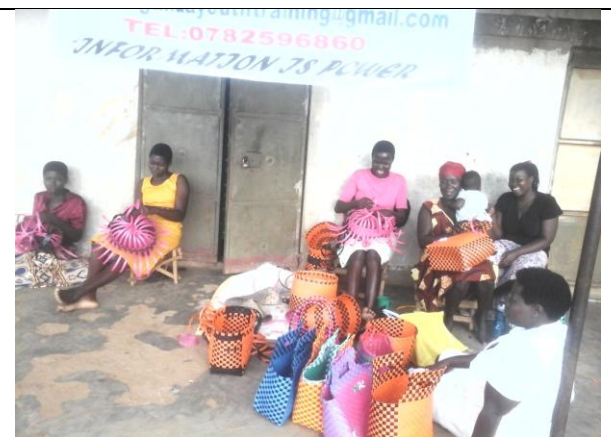
Community women and girls learn how to make shopping bags