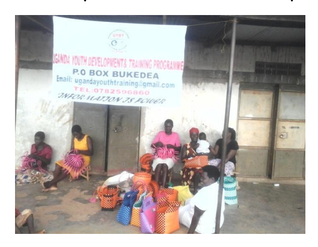
Women and girls trained in art and crafts during the programme out reaches