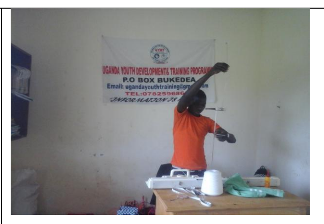
A student make sweaters