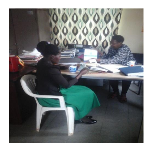
The director of UYDT in the office of Maureen (Mind set change office) the day of picking the tools