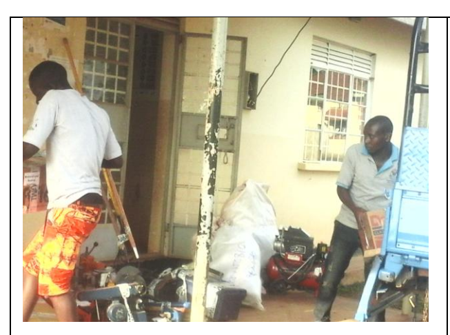
Youth offload the tools from the track on arrival to UYDT office premise