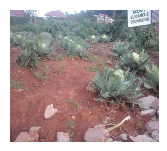
Cabbages in one of the pupils