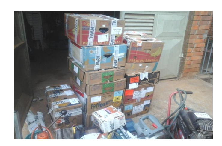
UYDT tools displayed at mindset change premises ready to be transported to UYDT office