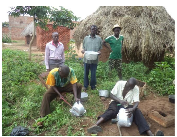
community members and leaders wacth the sourcepans That have been made being cleaned and made ready for use