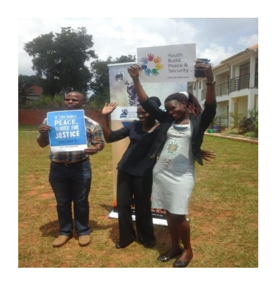
In the middle is the founder of UYDT