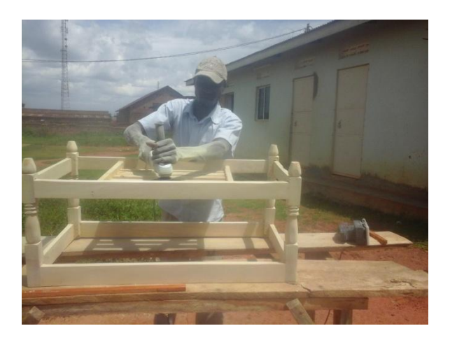
a student of carpentry on practice