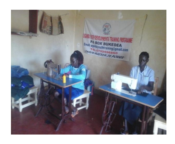
Students of Tailoring practice

In 2016, 250 students training in life skills and vocational studies (youth and women) where they gained skills in art and crafts, computer studies, hair dressing, metal works and metal fabrications etc.