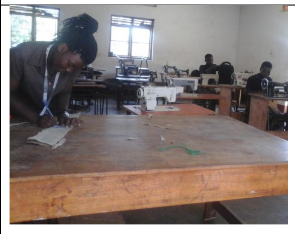
Students practicing during the tailoring sessions