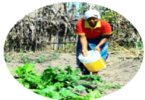
Nurturing Entrepreneurial Start-ups