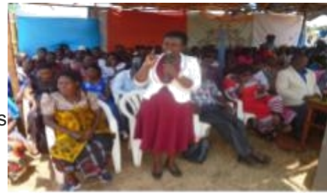
Working towards gender equality project in Tanzania