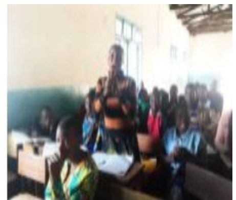
Entrepreneurship training programme in schools and colleges in Tanzania

Achievements: In the workshop, the participants discussed the various challenges the youth faced from entrepreneurship and the way forward.