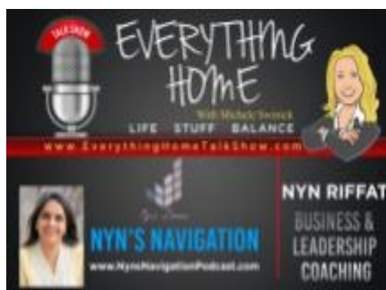
The founder of NYN'S Dream LLC

Today, she is an active business strategist helping start-ups & established organisations to structure growth plans & construct a strong brand design, an international motivational blogger, the founder of Nyn's Dreams LLC , a business consultation firm and one of the passionate global empowerment platforms for Diversity & Inclusion.