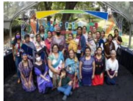
Gender Equality Forum In Mexico

participated in the forum in Mexico March, 2021 and Paris in June/July 2021. Our main aim is to promote girl entrepreneurs since their childhood in Tanzania. The goal of our is to attain sustainable development goal 5 i.e. gender equality . In the next 3 years, we will be providing various gender equality in entrepreneurship programmes to girls in schools, colleges, universities and among the community at large and will organize monthly events for this purpose. So far they have reached over 100 girls who were trained with entrepreneurship.