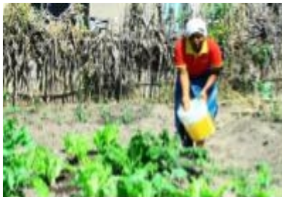
Watering vegetables, being motivated by MAWA (Girl Entrepreneurship)

It was first kicked off in Mexico City from 29-31 March 2021, will profile the draft Global Acceleration Agenda on Gender Equality, inclusive of all six Action Coalition Blueprints. We had (MAWA) joined hands with UN Women to promote gender equality in entrepreneurship. We