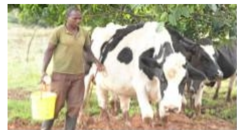
Started raising dairy cattle, motivated by MAWA

They are mentored and nurtured through school/college innovation clubs under the custody of MAWA and they meet every Wednesday after school/college hours.