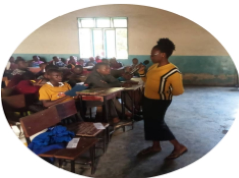
Entrepreneurship Training and Motivation