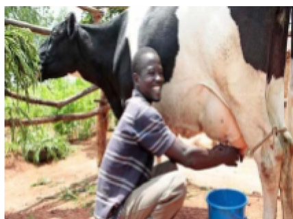
Lugaila started dairy cattle rearing called APE Milk