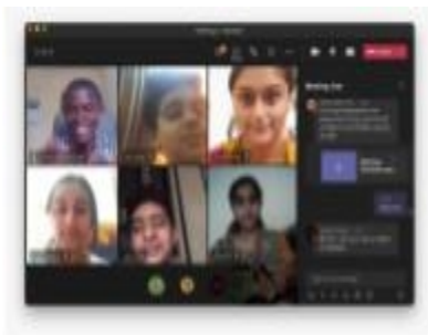
Online Entrepreneurship Among Students(Tanzania And Pakistan)