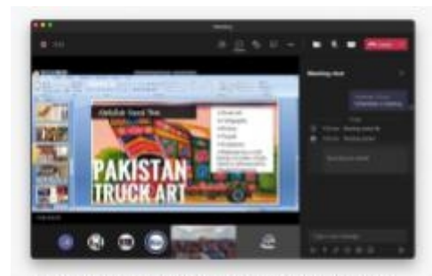
An online Entrepreneurship Cultural Exchange Programme

Achievements: The participants were able to learn and exchange various cultural aspects from Tanzania and Pakistan, they also were able to share views, ask questions and celebrate cultural entrepreneurship.