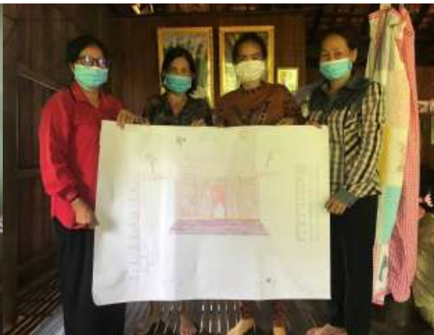
Homestay preparation at Koh Chraeng