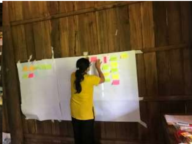
Brainstorming during the training of food & hygiene