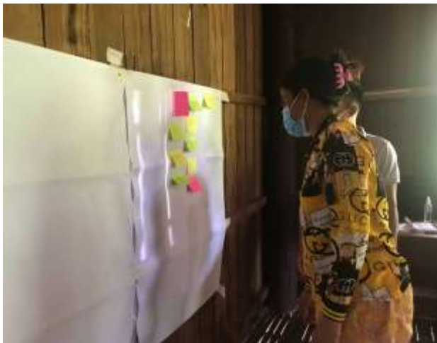
Food and hygiene training at Koh Preah

The team of Le Tonle had spent some of our time conducting some community capacity development in tourism. We were trying to make our time as useful as possible. It was challenging to gather during this time but at least we did something.