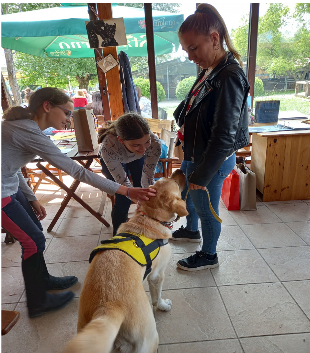
A therapy dog always follows his mentor's instructions.