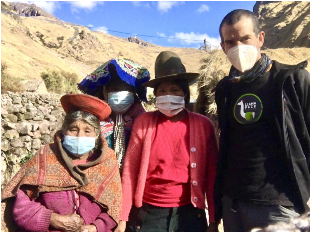
Figure 3 Coordination visit to Cancha Cancha community on October 2nd.

Although our country is still in state of emergency limiting several freedom rights, the extreme quarantine of Cusco region has been lifted on October 1 st which should set in place several measures that will allow us to implement the workshops with government authorization. We have already started visiting the communities so that the Guild of Llama Breeders can choose which members will attend the first workshops.