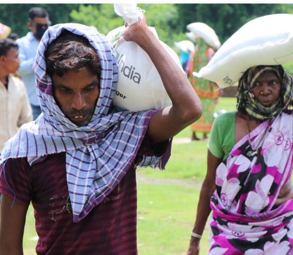
Zomato Feeding India launched a campaign to provide relief to daily wagers immediately after the government of India imposed the COVID-19 lockdown.

In an effort to support Zomato Feeding India's massive scaling effort, GFN provided targeted technical assistance to expand food banking beyond prepared foods to shelf-stable products, established a new inventory management system, and ensured sustainable operational procedures to accommodate future growth. Since March 24, FTDW has raised $4.4 million and expanded service to distribute 78.6 million meals across 181 cities nationwide.