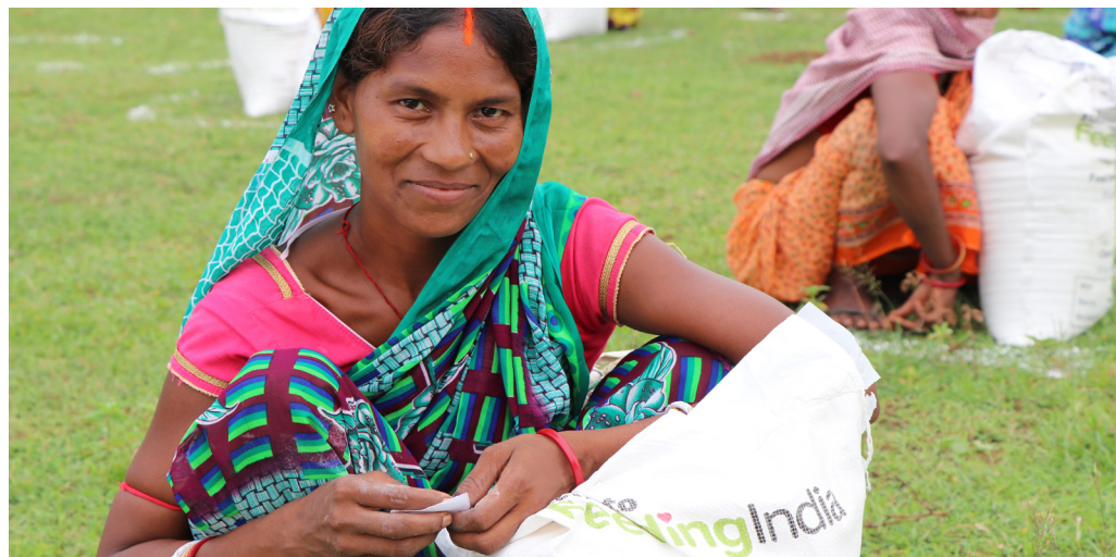
A woman receives a ration kit distributed by Zomato Feeding India at a food drive for daily wage earners and their families in Dhanbad, Jharkhand, in June 2020.