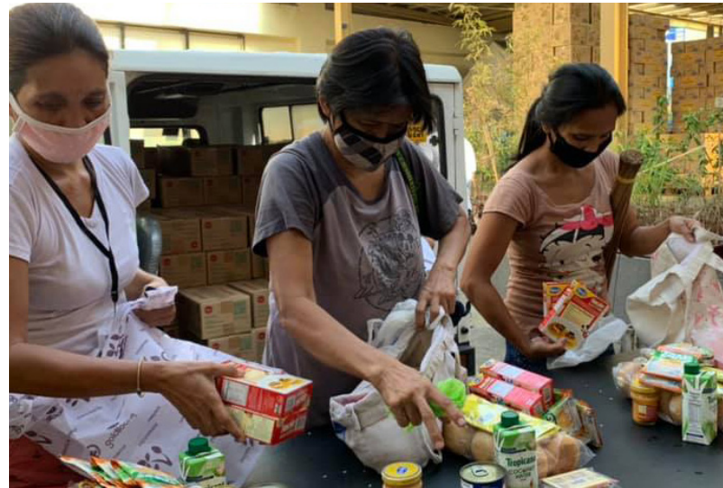
Better World Tondo hosts weekly food distributions in Tondo, Manila for people impacted by COVID-19. During these distributions, beneficiaries visit the food bank and are able to select food items necessary for their household.

Since the start of the pandemic, Good Food Grocer, Philippines has ramped up its distribution by 500 percent to reach a total of 350,000 people as of November. In the face of back-to-back natural disasters, the food bank leveraged its local networks to distribute emergency relief boxes with fresh fruit, non-perishable foods, and personal hygiene products to more than 2,700 families in the hard-hit region of Tiwi, Albay. In the month of November alone, the food bank reached 67,715 families including those displaced by typhoons.