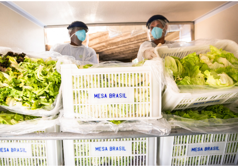
Mesa Brasil SESC in Campinas collects lettuce donated by Calusne Farms. Every day the food bank collects food that would otherwise go to waste to distribute to those in need in communities across Brazil.

As COVID-19 spread to Brazil, millions of Brazilians faced the challenges of unemployment, poverty, hunger, and growing caseloads. With nearly nine million infections and more than 215,000 deaths, the country is experiencing the third highest rate of COVID-19 infection in the world after the U.S. and India.