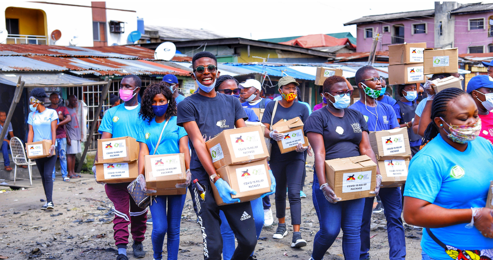
The Lagos Food Bank Initiative, with support from individuals and corporate volunteers, hand delivers vital food supplies to vulnerable populations living in under-served communities.

“With the global spread of COVID-19 and the lockdown which started in Lagos, Nigeria in March 2020, our organization became deeply concerned that the already existing food insecurity situation in Nigeria could possibly become more pronounced. We immediately shifted our model and started creating food packs with enough supplies that would last vulnerable families for one to two weeks. With a team of volunteers, we started going into these communities, delivering food packs using the door-to-door model. We’ve been able to serve more than 300,000 people facing hunger since the start of the pandemic. Our work matters because food is essential to the existence of every human being.”