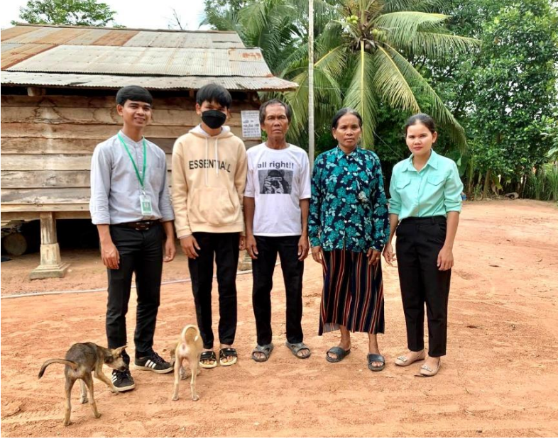
Photo 2: SHE selection process committee visiting a candidate's parents for the social investigation process in Varin on July 7 th , 2022.