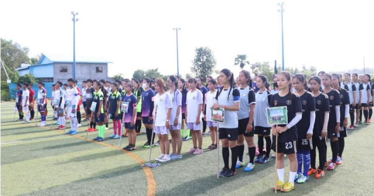
Photo 3: Football teams for the PEPY Championship Season IV on August 14 th , 2022.

PEPY Championship Season IV: PEPY's scholarship team, additional team members and 64 volunteered students joined together to organize the PEPY Championship Season IV at Palm Container Football Field from August 14 th to September 4 th , 2022. 10 teams (including 5 female teams in the women's division and 5 teams in the men's division) competed for the trophies, and both divisions comprised of scholarship students/alumni, Learning Center's students/alumni and staff. The whole tournament was finished in 4 weeks with over 200 participants joined the event each week