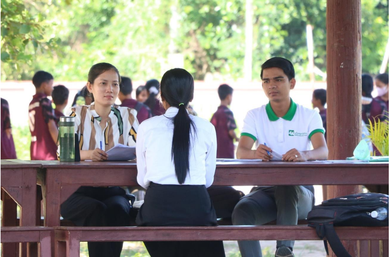
Photo 1: SHE selection process committee interviewing the candidate during the Interview Stage in Varin District on June 6 th , 2022.