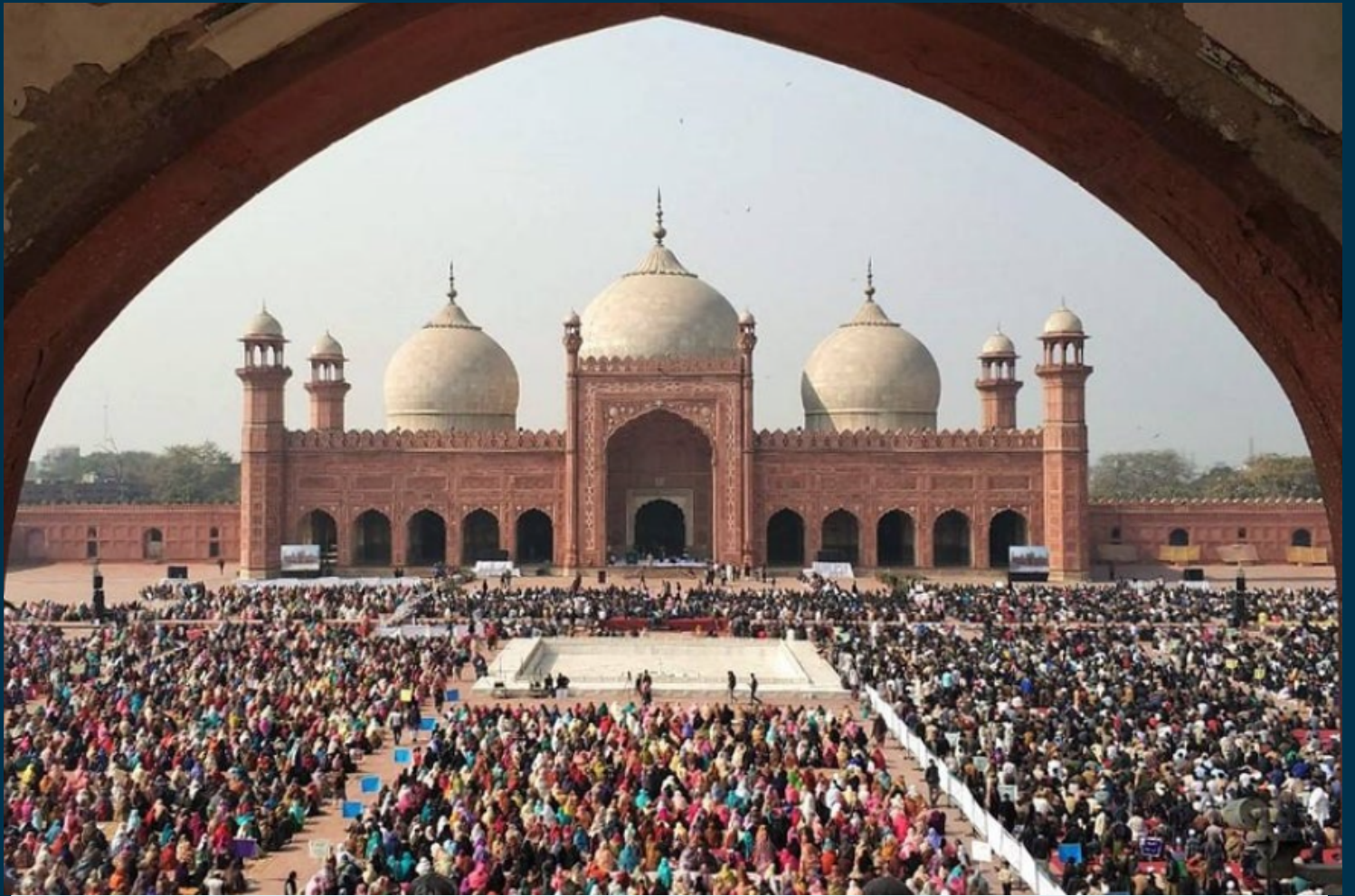
Loan disbursement event at Badshahi Mosque, Lahore