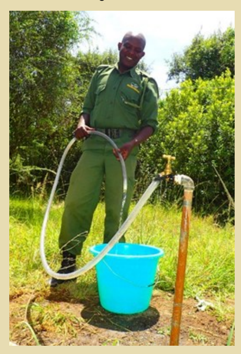
Figure 10. Running water at Camp Shannock was at long last completed this quarter.