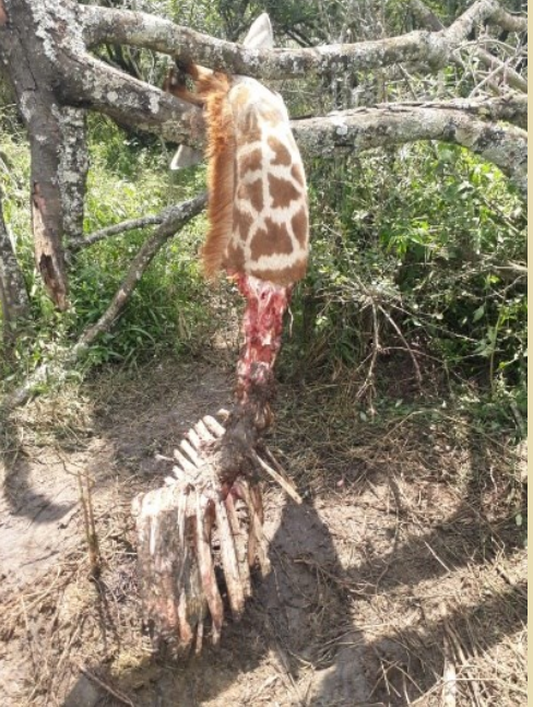
Figure 5. In July, two giraffe were strangled when their heads were stuck in the fork of trees. The first incident occurred near Memusi dam (L) while the second incident occurred in Block 9 three weeks later (R).