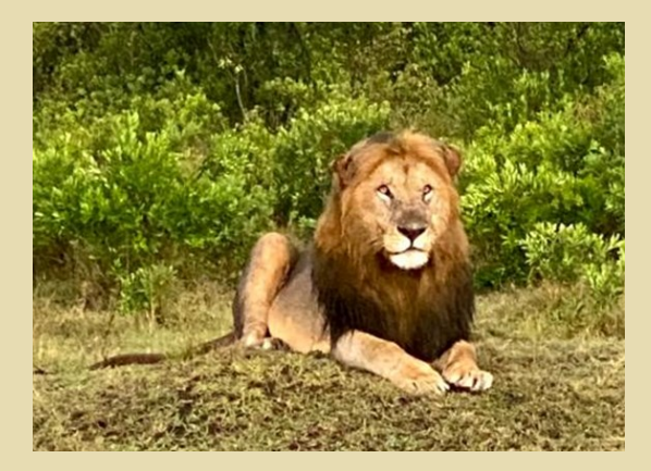
Figure 2. Barikoi is now wandering around Enonkishu .