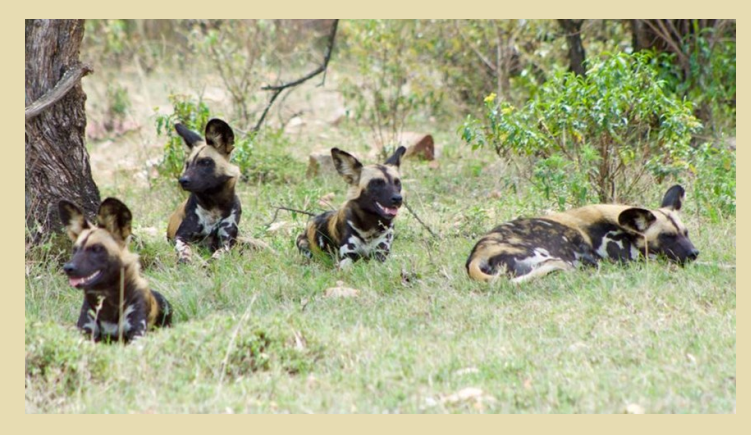
Figure 1. The "Gang of Four" wild dogs seen in Enonkishu on 24 September, and throughout the quarter.