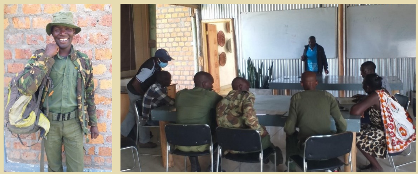
Figure 8. Enonkishu ranger (a) at his first day of classes. ESL classes (b) have been meeting at MTC since late August.