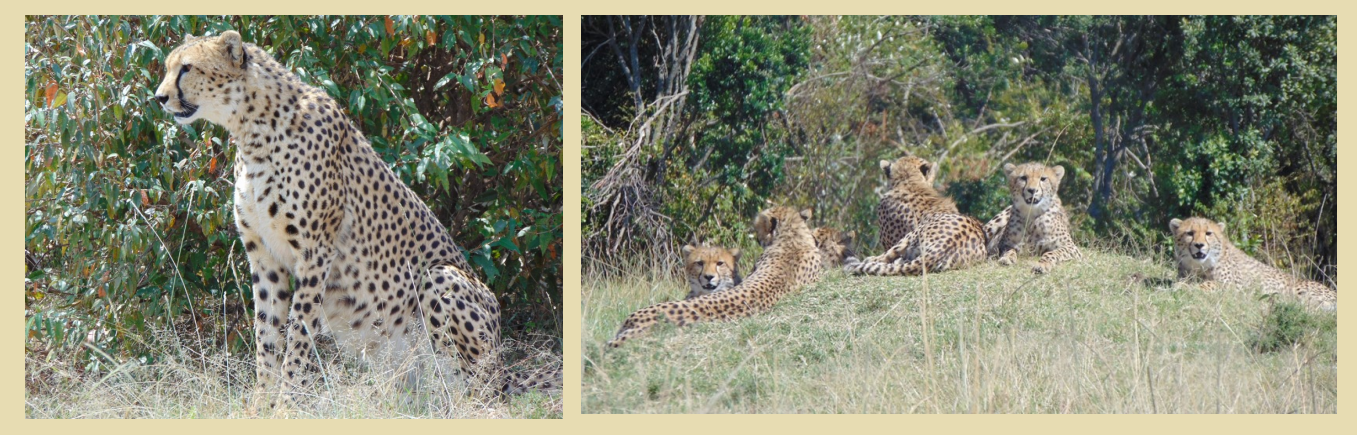
Figure 3. Kisaru and her six cubs the last time they were observed in Enonkishu all together on 31 July 2020.