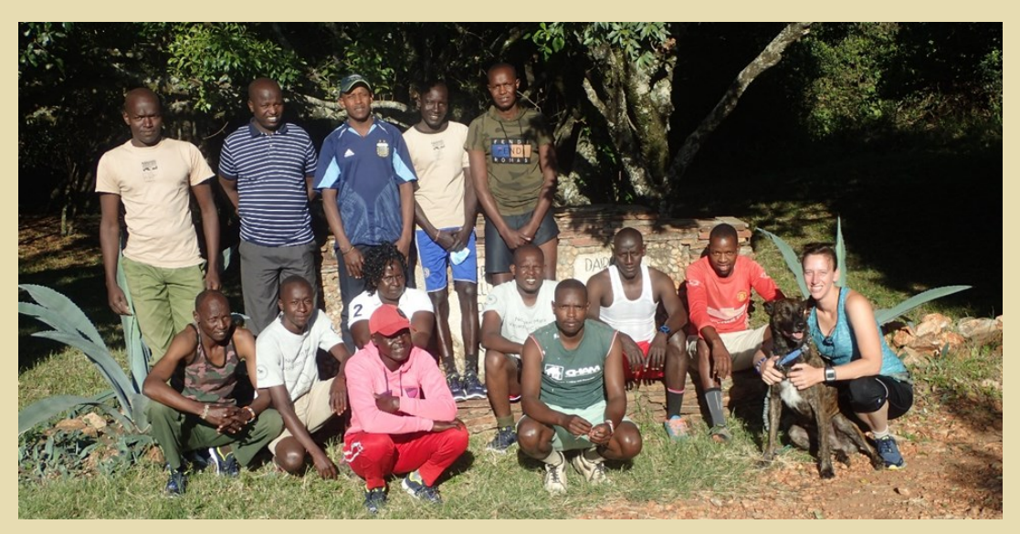
Figure 11. Employees from Naretoi and Enonkishu on the first training run of 2020, preparing for the inaugural Ultra MARAthon in December.