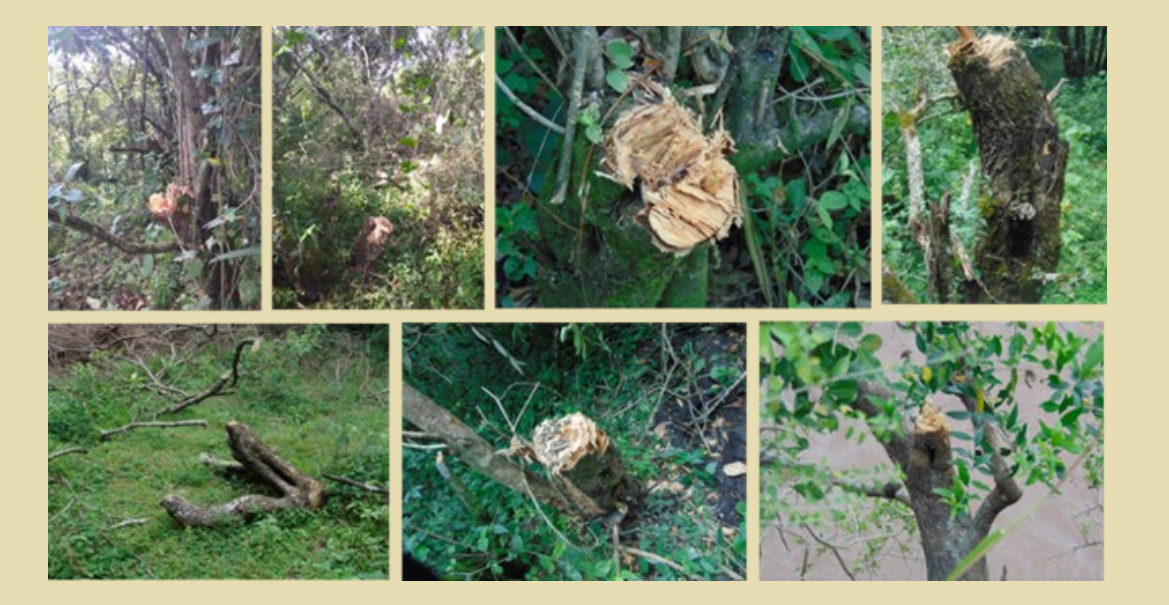
Figure 4 . Some of the olive trees cut down in Block 13 along the Mara River.