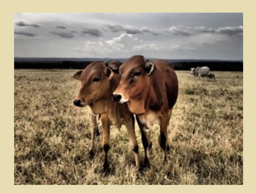
Figure 7. Two calves that were orphaned after the lion incident in January 2020 were weaned this quarter.