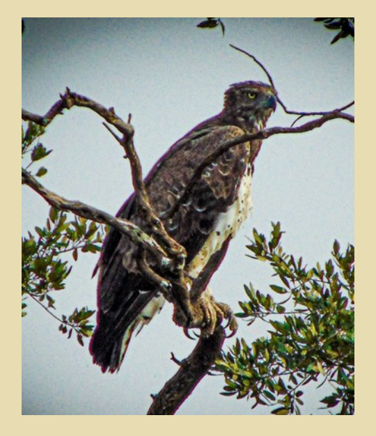
Figure 6. Enonkishu's 2N, a young adult female Martial eagle who has now been fitted with a band and tracking device.