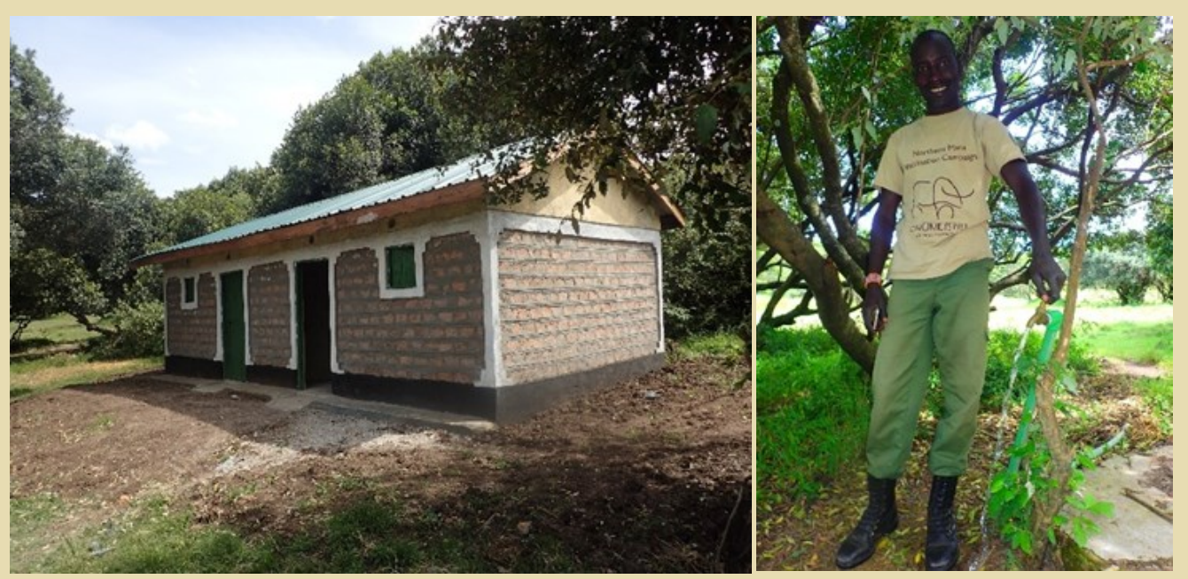
Figure 7. New construction at ranger outpost Chali Chali, including 2 bedrooms and piping water closer to the living quarters.