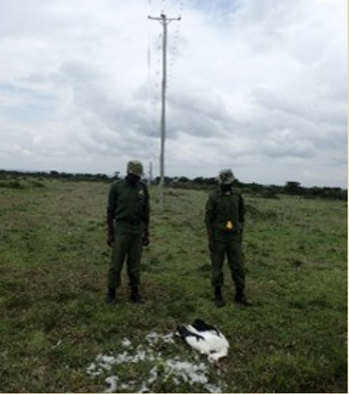
Figure 10. (Left) New power line poles extending into the conservancy. (Right) Rangers recording an incident of an electrocuted white stork along a power line.