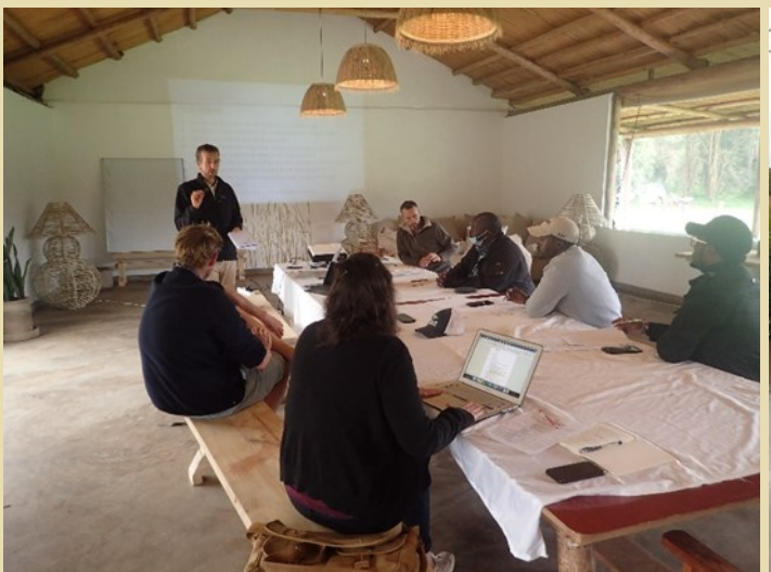
Figure 8. First quarterly board meeting for the new management company of Enonkishu Conservancy, building a foundation for transparency and strong governance.