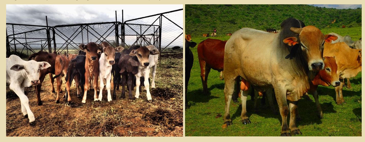
Figure 5. (Left) The calf kindergarten eagerly awaiting their mothers' return at the end of a full day of grazing. (Right) New bull joined Herds for Growth on 11 January.