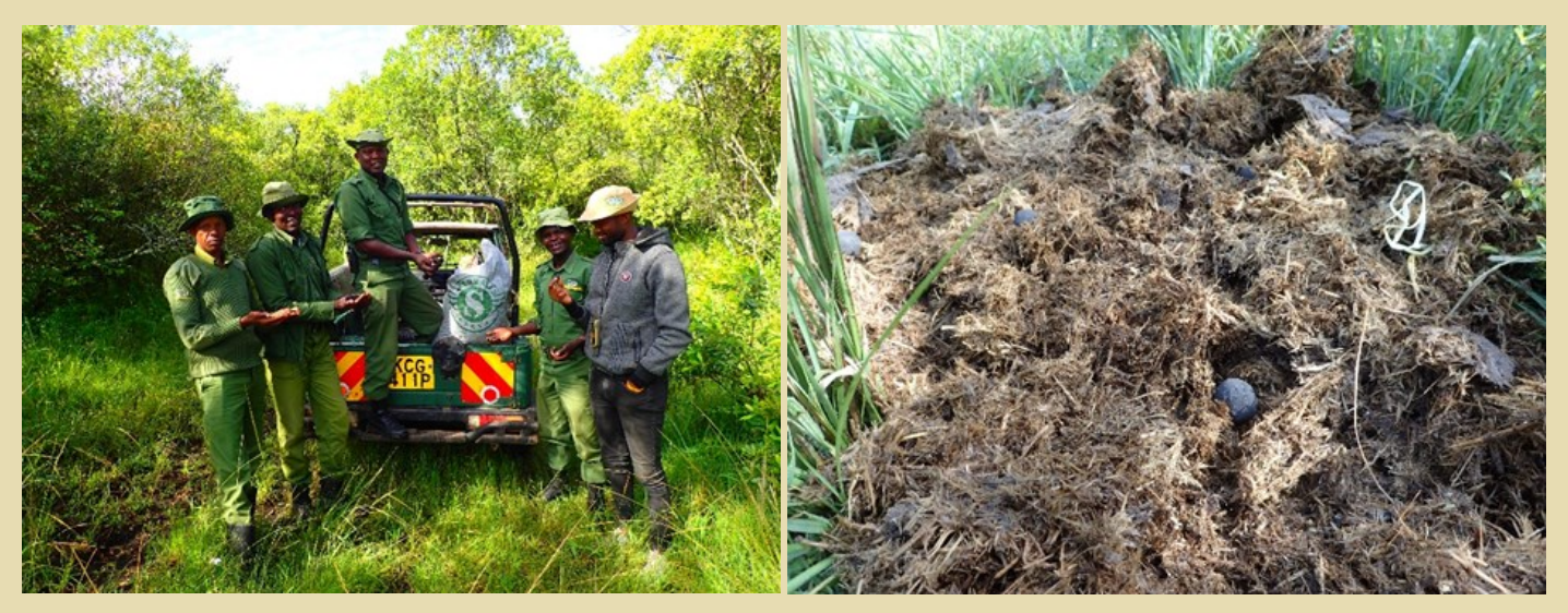
Figure 4. Rangers ready to distribute Olive seedballs in an area of the conservancy that has been deforested on 8 March. Dung piles were targeted for easy monitoring of germination, with the majority of seedballs dispersed in ideal habitat.