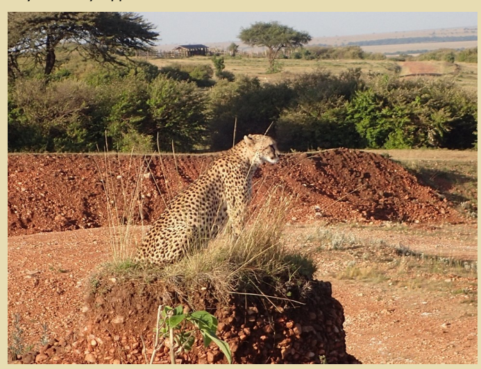
Figure 2. Kisaru, overseeing her conservancy from a murram pit perch on 23 March 2021.