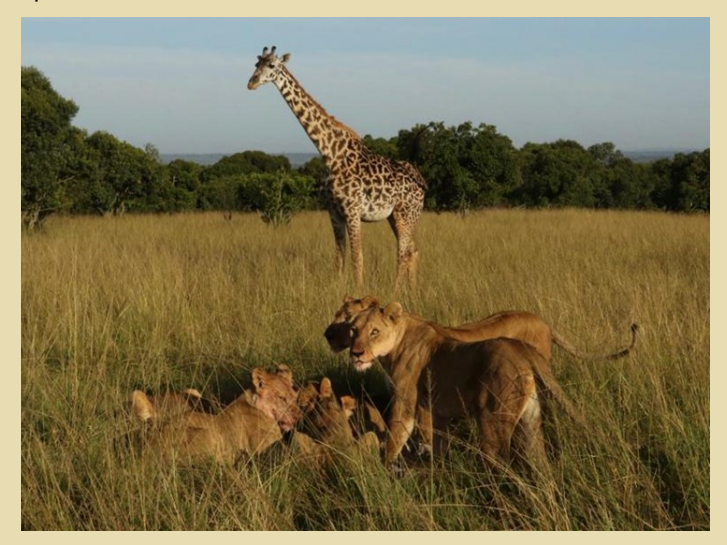
Figure 3 . Group of 2 lionesses and 4 older cubs killed a young giraffe on 24 March.