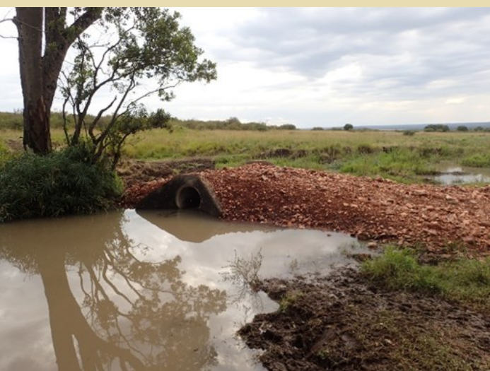
Figure 9. Newly installed culvert connecting Enonkishu to neighboring conservancy for all-weather access.