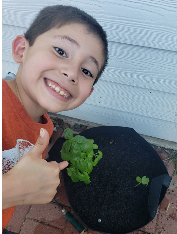
Planting Day- June 17, 2020