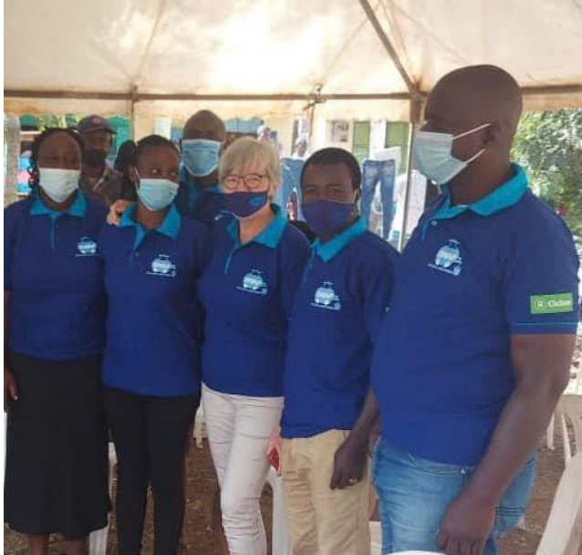
SWAP team during vaccination outreach