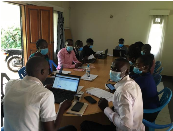
Data clerks entering vaccination data in SWAP's board room

SWAP took the initiative to invite a team of data entry clerks at the office and work on daily targets of data entry under the supervision of our data management team. In total 7600 entries were made and the back log was cleared.