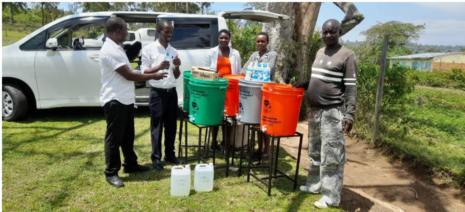
Supplies donated to Gari Dispensary during free cancer screening

Gari Dispensary in Nyakach Sub County in collaboration with partners organized a free cancer screening at their Dispensary. They reached out for support to enable them to comply with COVID-19 rules and regulations and requested for hand washing stations, soap, alcohol based hand rub and chlorine solution. SWAP was able to donate the above mentioned supplies to them which were used during the cancer screening days and later remained at the Dispensary which is in remote and rural area serving hard to reach and vulnerable communities.