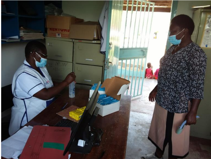
Handing over of Alcohol Based Hand Rub at soap the health care facilities

SWAP continued reaching out to 47 public health care facilities in Nyando and Nyakach sub counties on monthly basis to ensure they can practice proper hand hygiene to protect the health workers and patients. Hand washing stations were installed and soaps provided. Monitoring of proper use continued by health care workers and patients visiting the facility. The hand washing stations are placed in most of the patient care areas as well as at the entrance and close to the toilets. Alcohol based hand rub and soap was replenished.