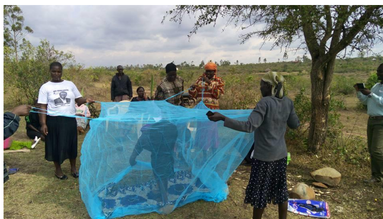
Figure 1 Net Hanging Demonstration

The USAID funded Health Communication and Marketing (HCM) Program with PSK as prime recipient ended prematurely in March 2020 after USAID terminated it due to insufficient funding. Activities focused on social behavioural change communication (SBCC) in the prevention of malaria and diarrhoea in Migori County and had scaled in Bungoma County as well. The activities were undertaken by trained community health volunteers (CHVs) supervised by community health assistants (CHAs) through household visits, small group communication sessions and community dialogue. The main objective was to improve adoption and maintenance of healthy behaviours related to malaria prevention, diarrhoea prevention, Net use, Malaria Case Management, increased intermittent preventive treatment in pregnancy (IPTP) uptake amongst pregnant women. In Migori County, CHVs trained were 138 in Awendo Sub County, while in Bungoma County, 97 in Kabuchai Sub County.