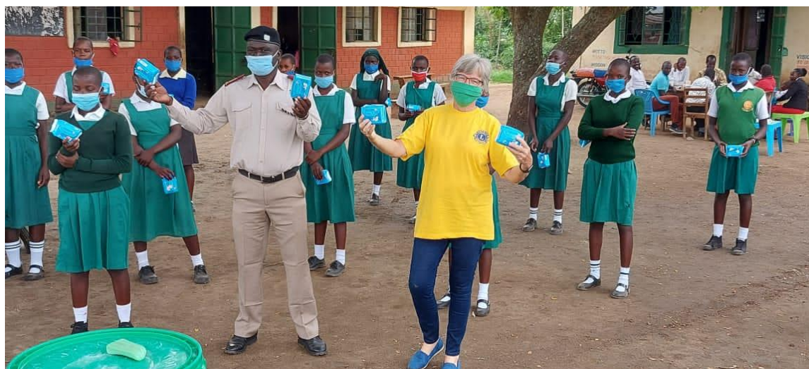
Figure 4 Sanitary Towels Distribution at Ombaka Primary School