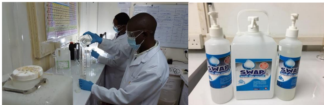
Figure 16 - Production of Alcohol Based Hand Rub

SWAP entered into an agreement with CDC for the production and distribution of Alcohol Based Hand Rub to 42 health facilities in Nyando and Nyakach Sub Counties. This project was successfully implemented in Uganda as well. The aim is to support health care facilities with improved hand hygiene and prevent COVID-19. Monthly distribution and monitoring is ongoing.