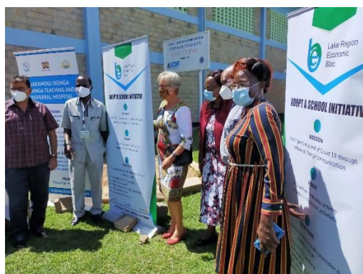
Figure 17 - LREB COVID 19 Advisory Committee introducing the Adopt a School Initiative