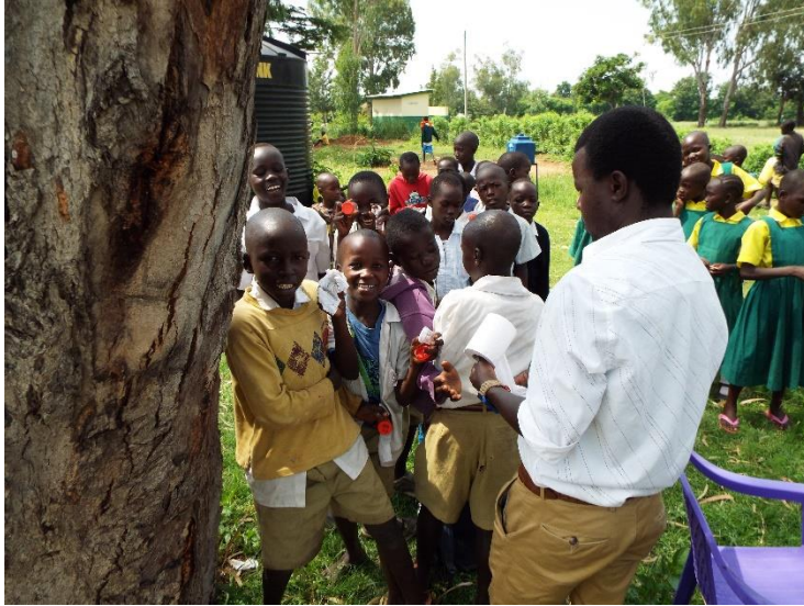
Figure 8 School sample collection for bilharzia