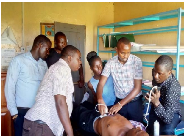
Figure 9 Sonographers training in Uganda

The objectives of this research were to define what constitutes control of bilharziasis-related morbidity for S. mansoni in western Kenya as a tool to guide implementation decisions for country program, to identify infection levels of S. mansoni below which there is little, or no detectable schistosomiasis-associated morbidity and to define a tool on what constitute S. mansoni -related morbidity to guide implementation decisions for programs. Samples collection was completed in 45 Villages; 29 and 16 in Siaya and Vihiga Counties respectively. Kato katz microscopy, data analysis and review completed and initial findings disseminated in Siaya and Vihiga Counties stakeholders' forum. Ultrasound data collected and analysed in accordance to Niamey protocol. Treatment of study participants for Soil Transmitted Helminths was successfully accomplished. Shipment of samples to Leiden University Medical Centre, Netherlands was done.