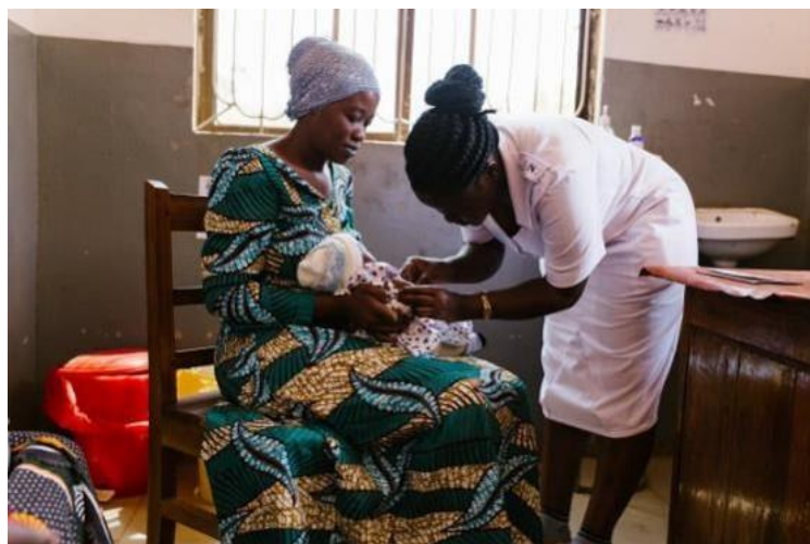
Figure 7 Continuum of Care during Postnatal Period

This study was evaluating the impact, cost effectiveness and sustainability of conditional cash transfer in retaining rural women in the continuum of care during pregnancy, birth and post-natal period. 5,488 mothers were enrolled across 48 health facilities in Siaya County. The study ended in August 2020. All study deliverables were achieved. There was prompt and effective communication with all the program partners. An External audit with independent auditor was successfully accomplished.