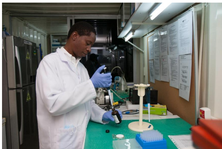
Figure 15 Lab Manager at work in the Water Lab

SWAP procured two STREAM disinfectant generators for the production of 0.5 % sodium hypochlorite which was tested in the lab and will be installed in two health facilities in Kisumu County and to support the infection prevention and control and to treat water.