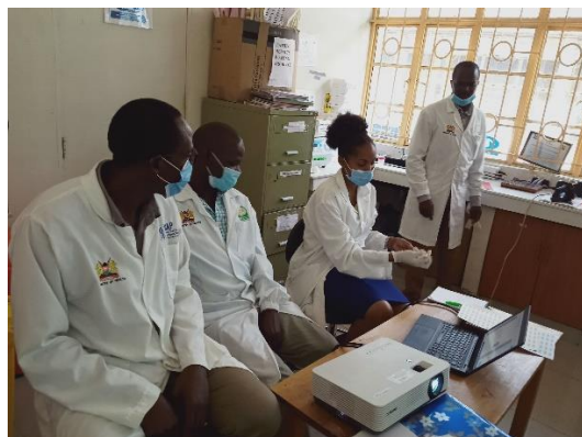
Figure 13 Training of Lab Technicians in Muhoroni

The chronic kidney disease study was evaluating the presence of chronic kidney disease among sugar cane cutters which has been found in other studies. SWAP targeted 1,000 cane cutters but only managed to reach 788. This was 80% of the households in Tonde, Owaga and Muhoroni East Sub locations. The study was in collaboration with UIC, Muhoroni County Hospital Laboratory and KEMRI.