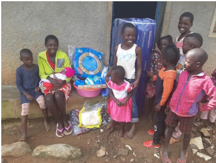
Figure 3 OVC support

SWAP continued supporting selected orphans with school fees and requirements as well as upkeep. Others were referred to us for support where cost sharing was done with relatives and the community.