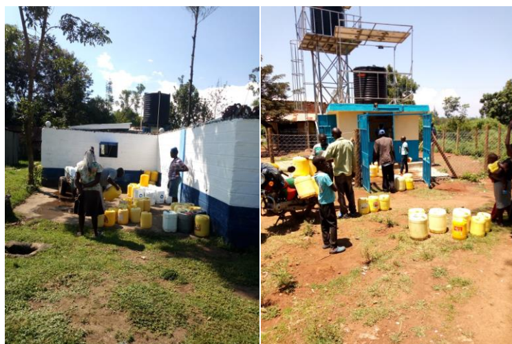
Figure 12 - Solar Powered Water Disinfection Units at Ahero and Mugruk

Scaling the solar power water treatment using ozonation in Ahero and Chuth ber was completed and both sites are fully operational. The treatment chain included the addition of a flocculating agent (aluminum sulfate) to the water before it is ozonated. The local CBOs who will manage the water enterprises have received training and ongoing mentorship and water tests are done for quality control. Water is sold at affordable price to the general public and water vendors.