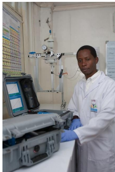
Figure 14 STREAM devices in Water Lab

SWAP received funding to extend its activities in 27 health care facilities in Rarieda Sub County where previously WASH and Waste Management assessment of 27 HCFs, training of health workers and distribution of WASH commodities was done with additional refresher training, joint monitoring and a final evaluation expected in July 2021. SWAP scaled this following the successes with similar activities in Nyando and Nyakach Sub Counties at 42 health facilities. The baseline assessment was completed and findings disseminated as well as training done of In-charges of all facilities, community health assistants and volunteers and casuals on social behavioural change communication, WASH standards, Hygiene promotion and COVID-19 prevention. Ahero County and Katito Sub County hospitals will early 2021 receive STREAM disinfectant generators which produces 0.5% sodium hypochlorite for infection prevention and control as well as treatment of water. Joint monitoring will continue in the first quarter of 2021.