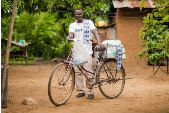
Figure 2 Door to door sales by CHV