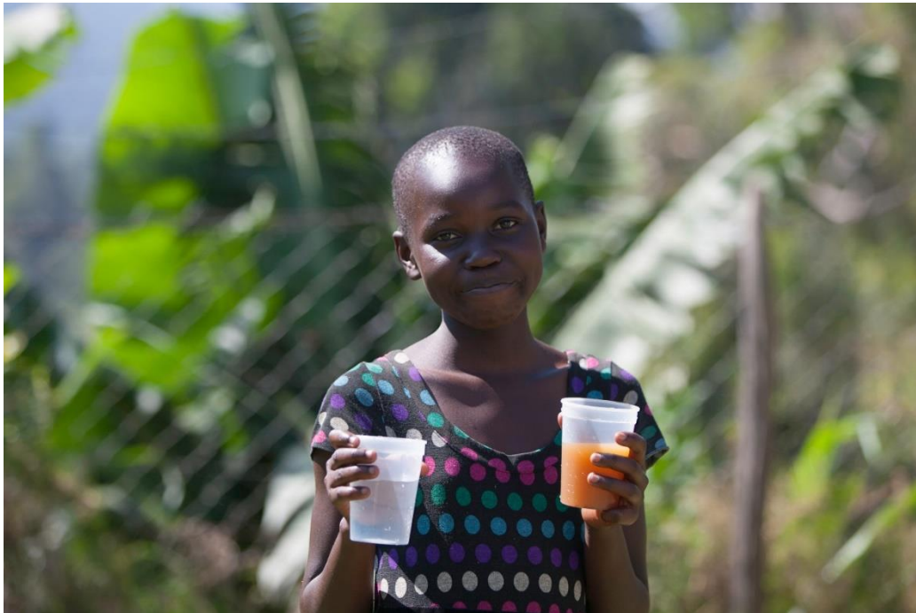
Figure 20 Happy Costumer drinking safe and clean water