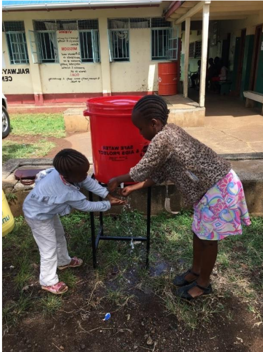
Figure 5 Hand Washing Stations for HCF