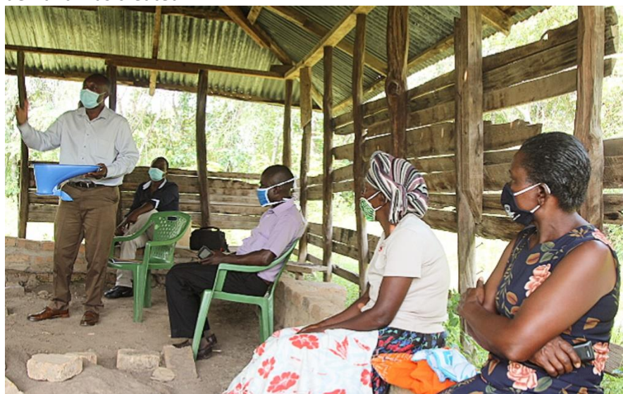
Figure 11 Sato toilet demonstration

This was an evaluation of the Feasibility and Acceptability of Novel Covered Sanitation Platforms in Healthcare Facilities. We targeted 18 health care facilities in Nyando and 19 in Nyakach Sub Counties. The installation was completed and a final evaluation done in September 2020. We received a donation of 100 Sato Pans from the Lixil Corporation and continued to do the social marketing after demand was created. Artisans were trained to support the installation. A total of 121 satopans were installed in all the 37 health facilities. The final findings of the program were shared with Kisumu CHMT and in the UNC Water and Health Conference held on 27 th October 2020. SWAP continued the social marketing of this product after demand was created.