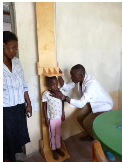
Figure 10 Morbid team during field work