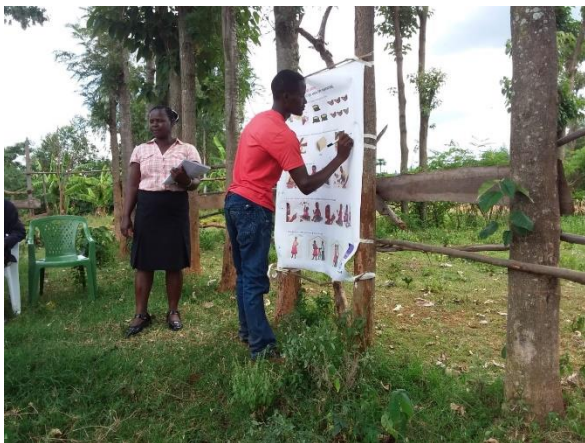
Figure 6 Booster parenting sessions by CHV

The study tests different potentially cost-effective delivery models for an ECD intervention with a curriculum that integrates child psychosocial stimulation and nutrition education.