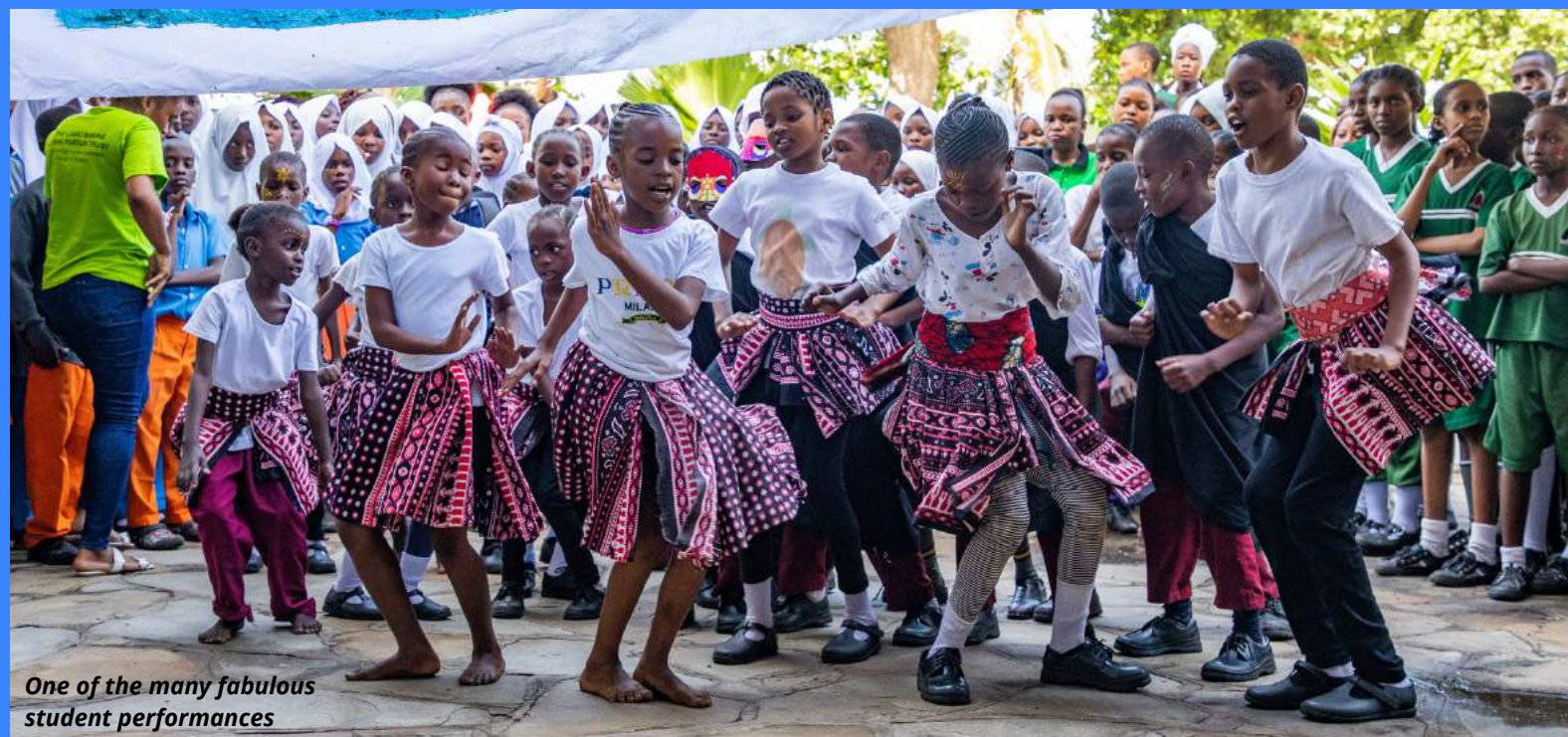
One of the many fabulous student performances