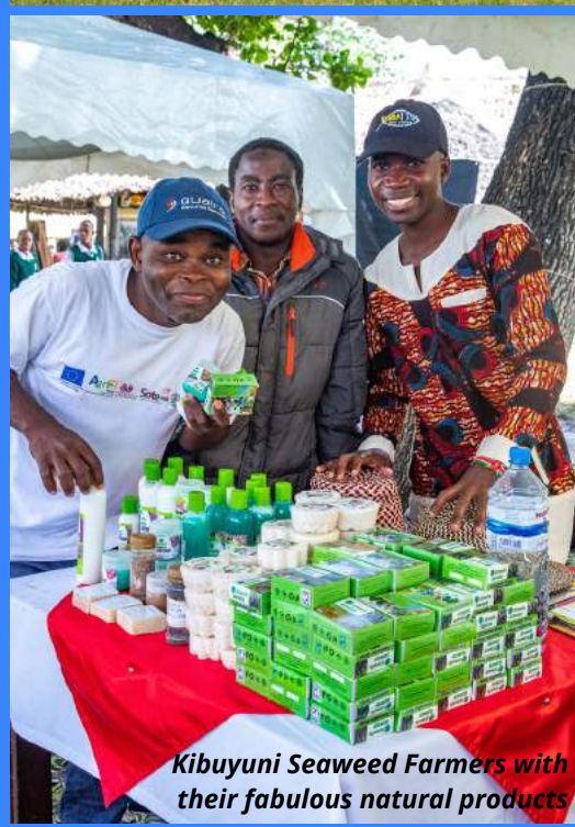
Kibuyuni Seaweed Farmers with their fabulous natural products