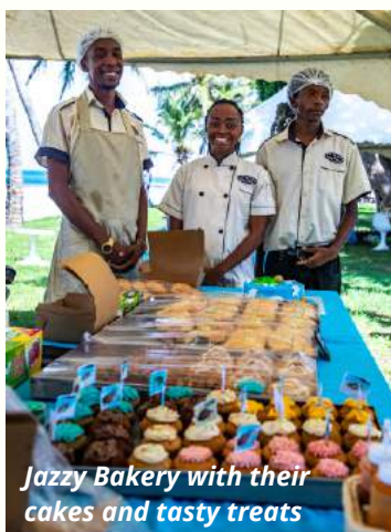
Jazzy Bakery with their cakes and tasty treats

Hot and cold food options were available from Safari Beach Hotel and Jazzy Bakery, with paper packaging sponsored by Terra Safi to help us achieve our goal of a plastic free event. We were delighted to have free water stations throughout the festival, sponsored by Aquelle. Festival goers were asked in advance to bring refillable bottles!