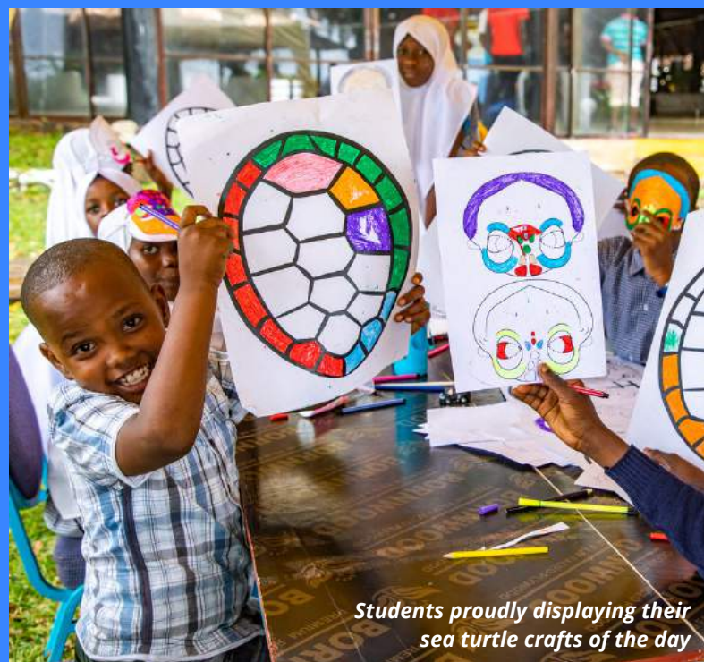
Students proudly displaying their sea turtle crafts of the day