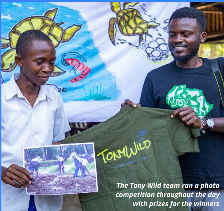
The Tony Wild team ran a photo competition throughout the day with prizes for the winners