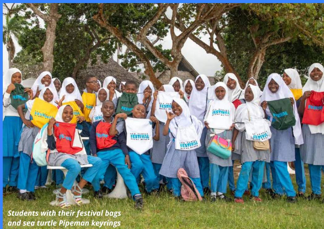
Students with their festival bags and sea turtle Pipeman keyrings