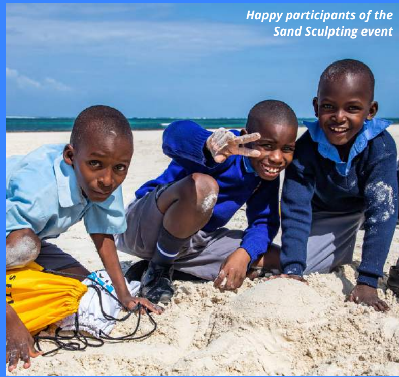
Happy participants of the Sand Sculpting event