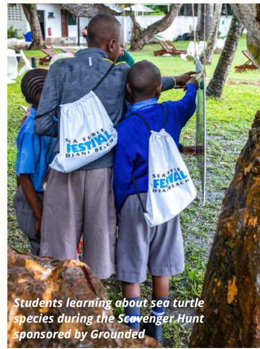
Students learning about sea turtle species during the Scavenger Hunt sponsored by Grounded