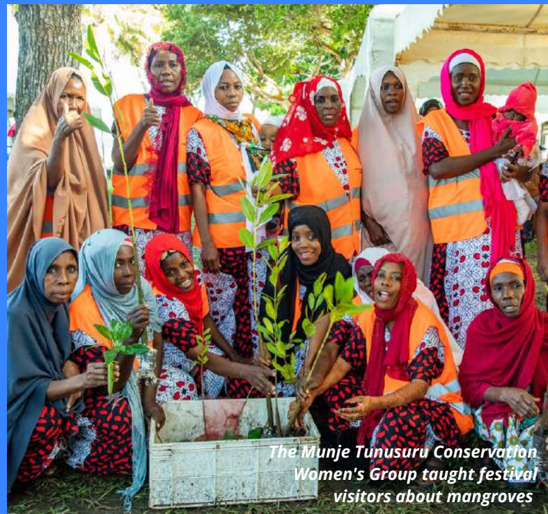
The Munje Tunusuru Conservation Women's Group taught festival visitors about mangroves