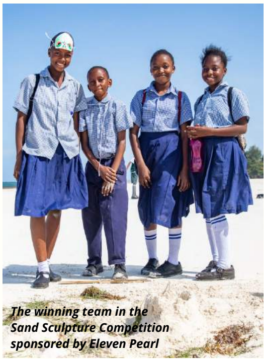
The winning team in the Sand Sculpture Competition sponsored by Eleven Pearl

The Sea Turtle Festival is an annual event held in Diani Beach to spread awareness about sea turtles; what they are, the threats they face, and how we can better protect them. The festival falls on-or-close-to World Sea Turtle Day on June 16th each year, and is a free event with a variety of fun and educational activities for all ages.