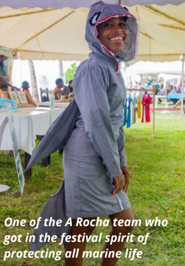
One of the A Rocha team who got in the festival spirit of protecting all marine life