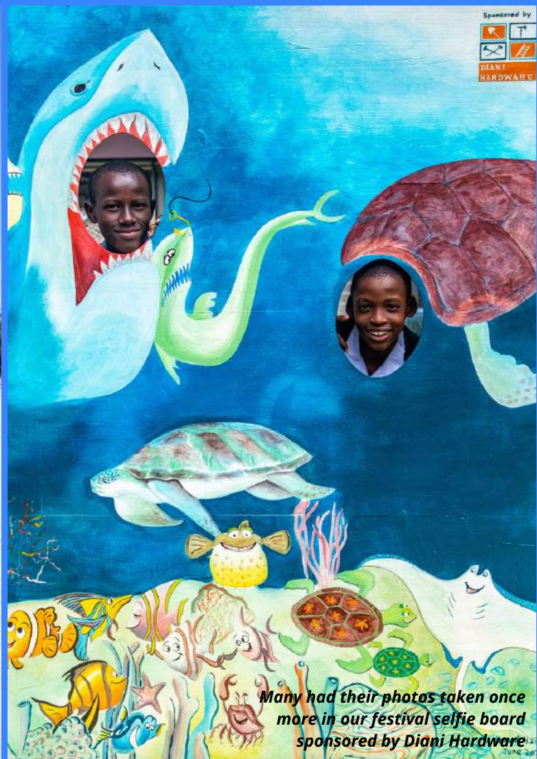
Many had their photos taken once more in our festival selfie board sponsored by Diani Hardware