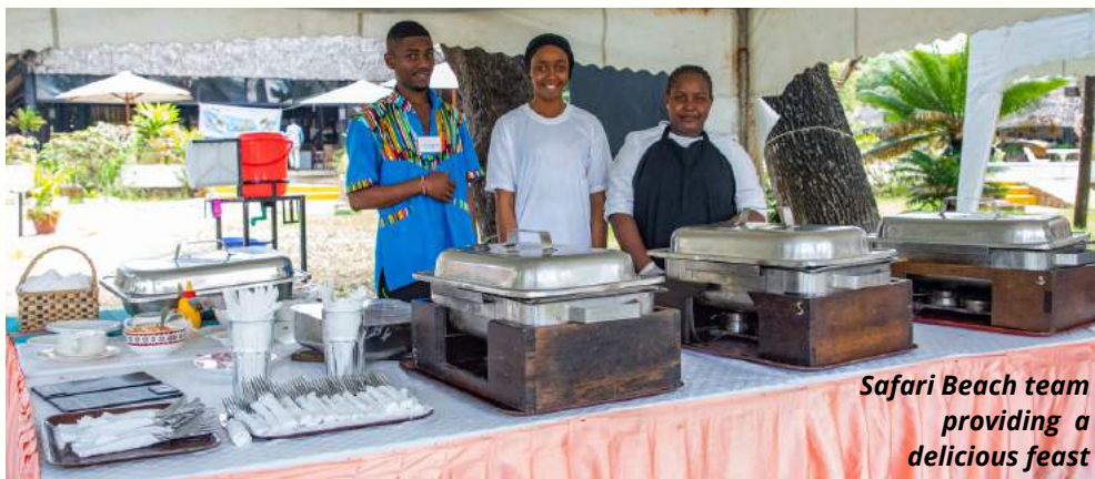
Safari Beach team providing a delicious feast