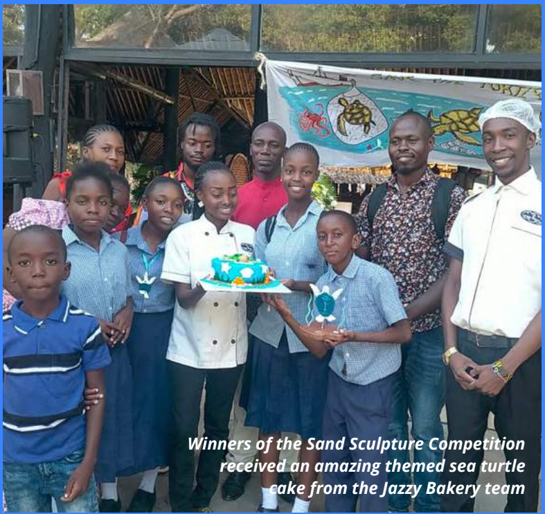
Winners of the Sand Sculpture Competition received an amazing themed sea turtle cake from the Jazzy Bakery team