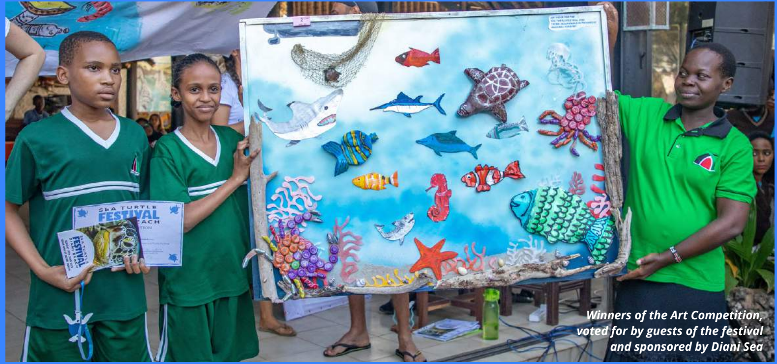
Winners of the Art Competition, voted for by guests of the festival and sponsored by Diani Sea