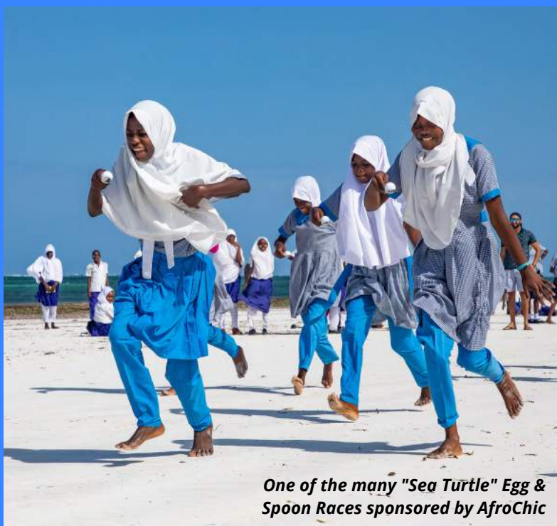
One of the many "Sea Turtle" Egg & Spoon Races sponsored by AfroChic