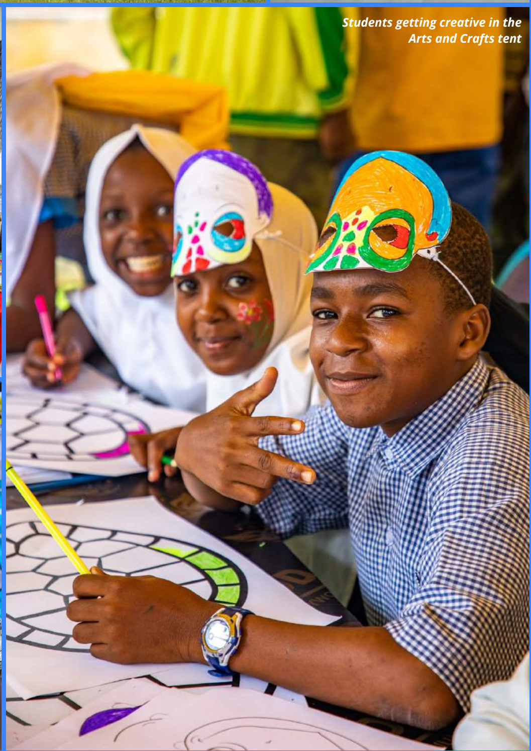
Students getting creative in the Arts and Crafts tent