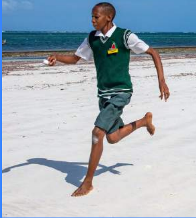
One who sped ahead of the rest in our Egg & Spoon Races