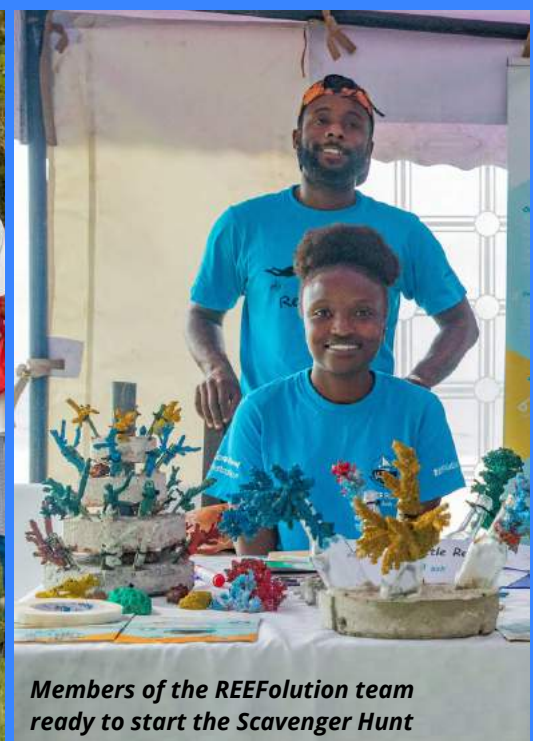
Members of the REEFolution team ready to start the Scavenger Hunt