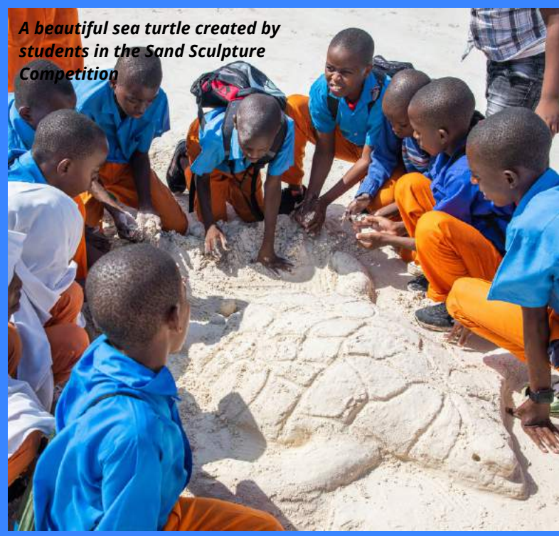
A beautiful sea turtle created by students in the Sand Sculpture Competition