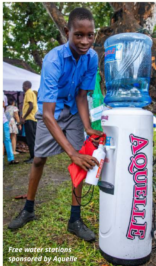
Free water stations sponsored by Aquelle

Hot and cold food options were available from Safari Beach Hotel and Jazzy Bakery, with paper packaging sponsored by Terra Safi to help us achieve our goal of a plastic free event. We were delighted to have free water stations throughout the festival, sponsored by Aquelle. Festival goers were asked in advance to bring refillable bottles!