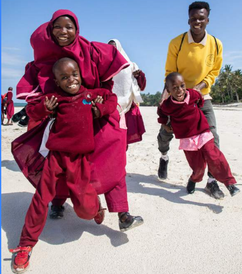
Students were delighted when the sun came out and our beach activities began