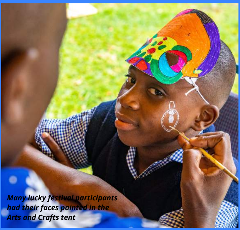
Many lucky festival participants had their faces painted in the Arts and Crafts tent