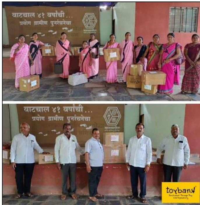
Caption: Our Programme partners and Play Centre Facilitators pose with the games and play materials that were replaced after stock and quality checks at play centres.

The programme team conducted stock and quality checks at the Play2Learn centres and initiated the process of restocking the games and play material at 114 centres . The team ensures that children have access to not just age-appropriate and category-wise games, but also that these games are in good condition. This also allows the PCFs and programme team to conduct play sessions smoothly.