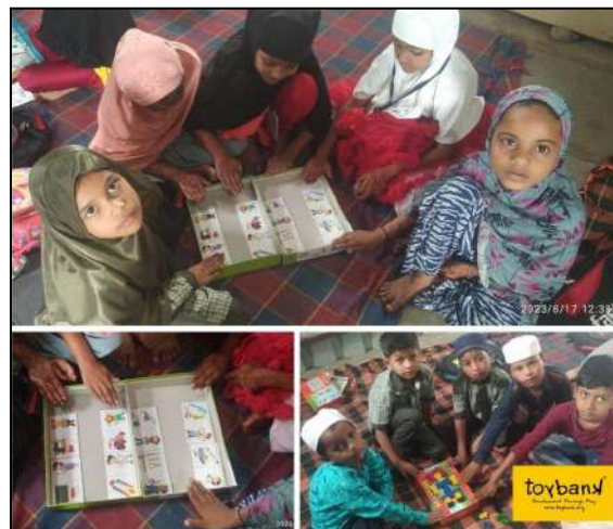
Caption: Children from Play2Learn Centre R258 play with puzzle and block games in group.