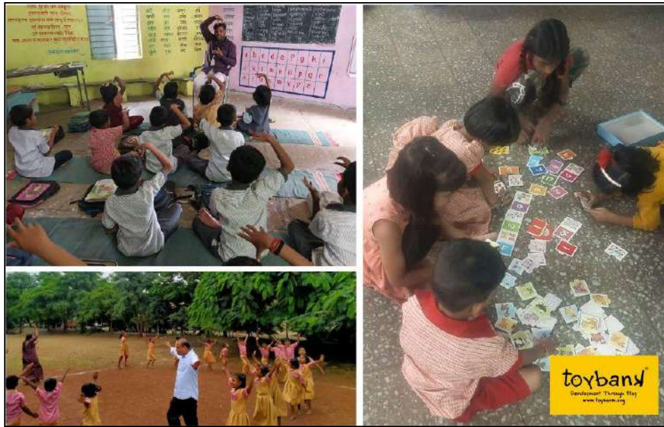
Caption: PCFs & Children from Play2Learn Centres R338, R329 & U34 engage in action songs activities and puzzle games.