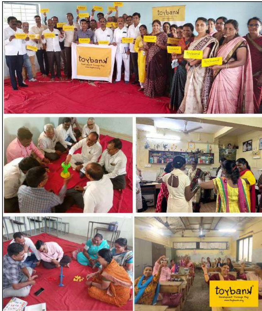
Caption: Teachers collaborated, shared their challenges and worked together to complete puzzles and games. They also identified and discussed various skills each game would boost in children post the session