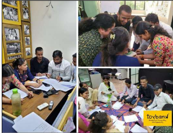
Caption: Programme Outreach team gathered in office to refresh their learning and through interactive activities shared their on-field experiences.

The programme outreach team participated in a number of training sessions led by Toybank to better understand play and its significance. The training consisted of a refresher session on Play and its components, Play Facilitation and Behaviour Management, as well as play session demonstrations of the new sessions by our outreach officers.