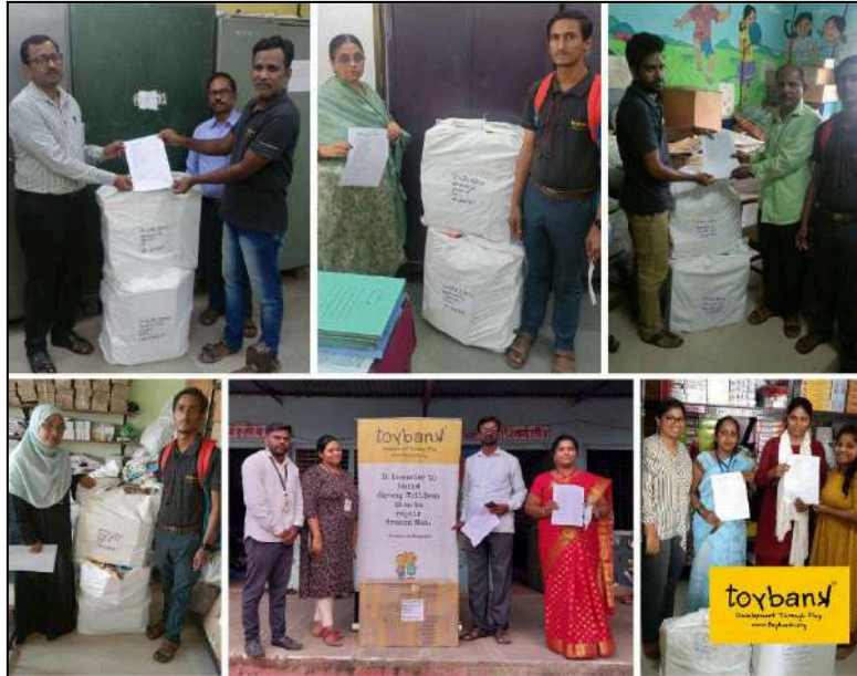
Caption: Our Programme partners and Play Centre Facilitators pose with the games and play materials that were replaced after stock and quality checks at play centres.

The programme team conducted stock and quality checks at the Play2Learn centres and initiated the process of restocking the games and play material at 114 centres . The team ensures that children have access to not just age-appropriate and category-wise games, but also that these games are in good condition. This also allows the PCFs and programme team to conduct play sessions smoothly.