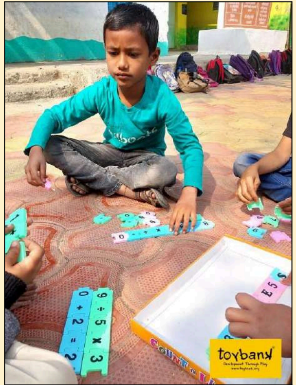
Caption: Children engage in the puzzle game of "My first Sums"