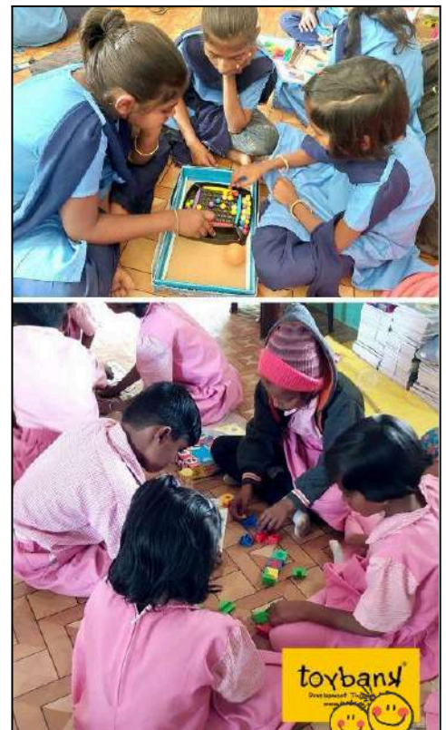
Caption: Group of children engage in age-appropriate block-based and puzzle games.