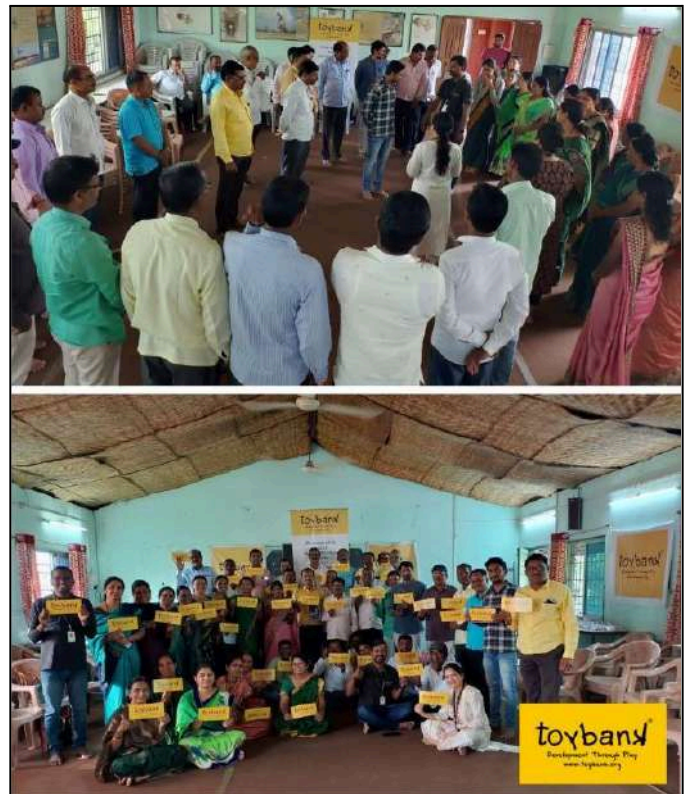
Caption: Teachers collaborated, shared their challenges and worked together to complete puzzles and games. They also identified and discussed various skills each game would boost in children post the session