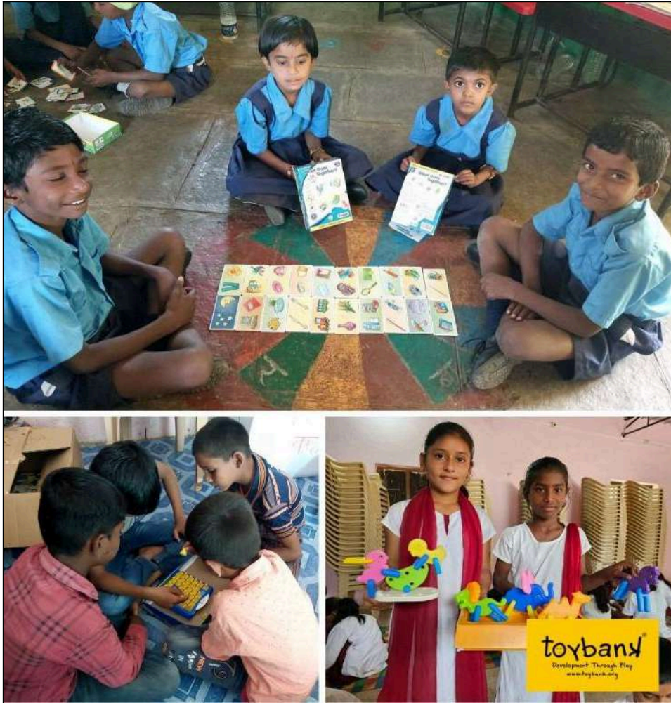
Caption: Group of children engage in age-appropriate block-based and puzzle games.

During our feedback calls, teachers highlighted that our hybrid Play2Learn Programme is: