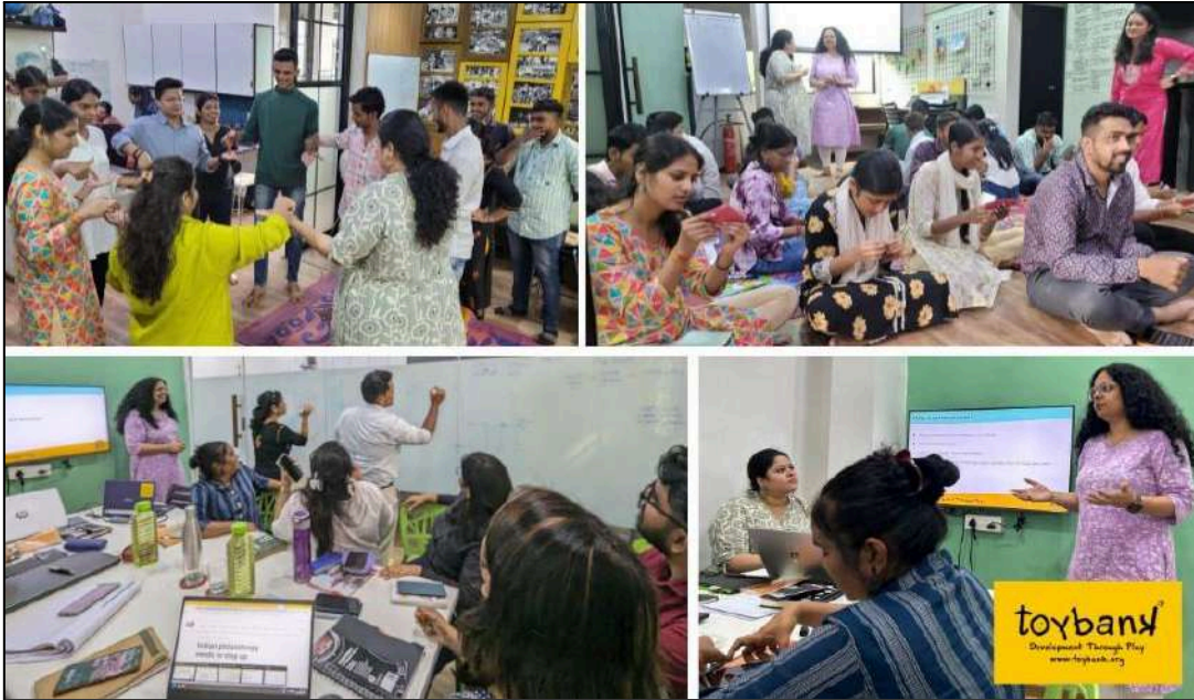
Caption: The Toybank team goes through Communications training where they engage in interactive activities and discussions

In November 2023, a Communication training workshop was conducted for the Programme, Inventory and Resource Mobilisation teams to help them better understand how to represent Toybank’s work, and how Communication is more effective when it’s collaborative.