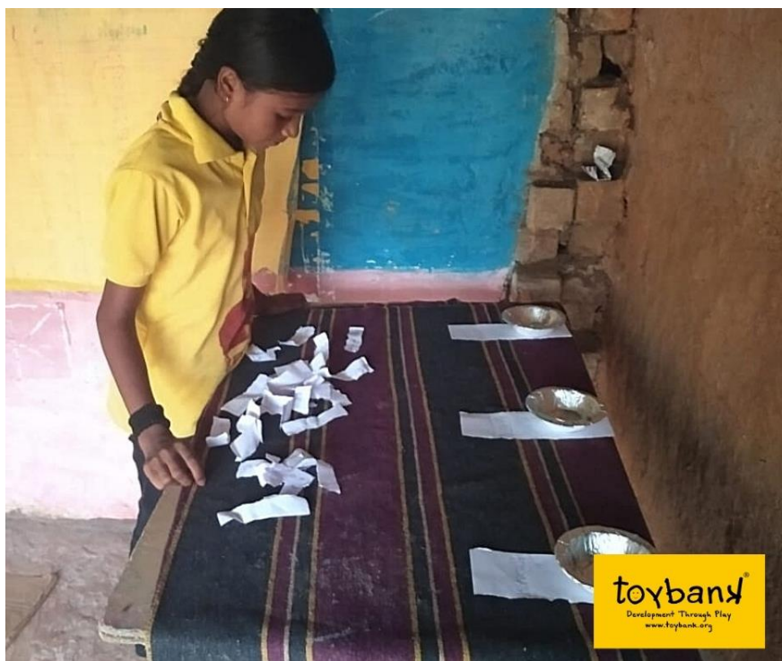
Children practice basics of grammar through this fun activity Sorting Tenses