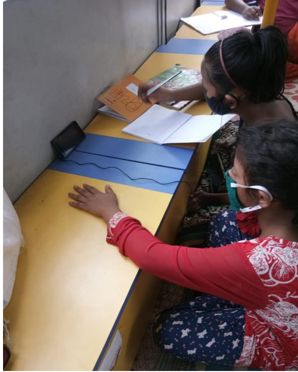
Digital Device Use by children