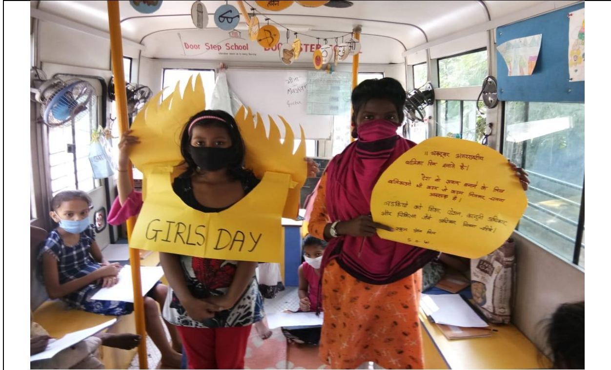
Girl Child Day Celebration