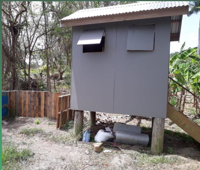
Eco-friendly compost toilet

Some of the sustainability features on Kamp Deed and Mudhouse Productions