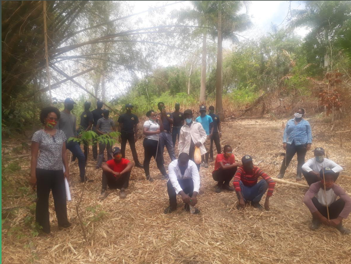
On Kamp Deed