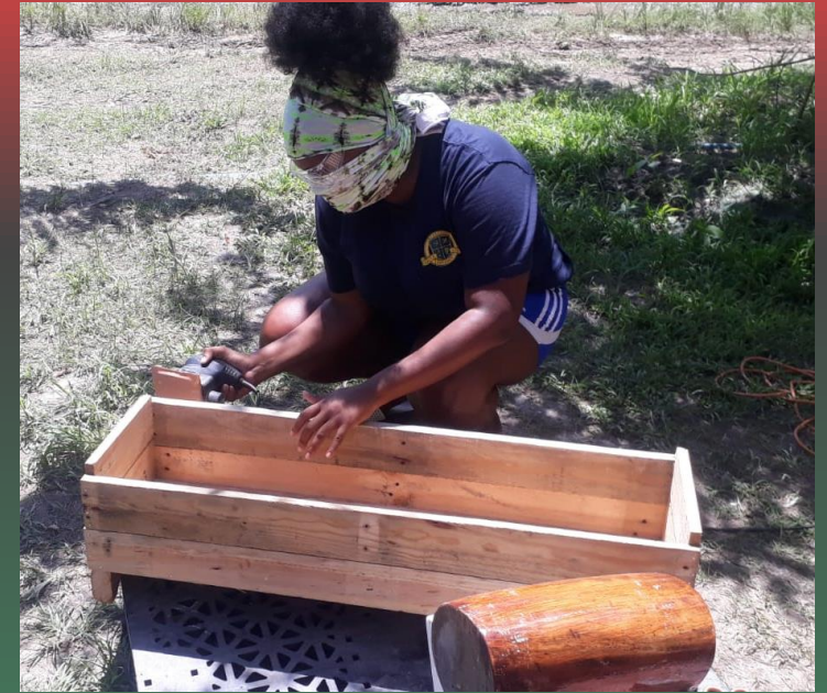
Building with pallet wood

We also have spring water, outdoor bamboo showers and solar power