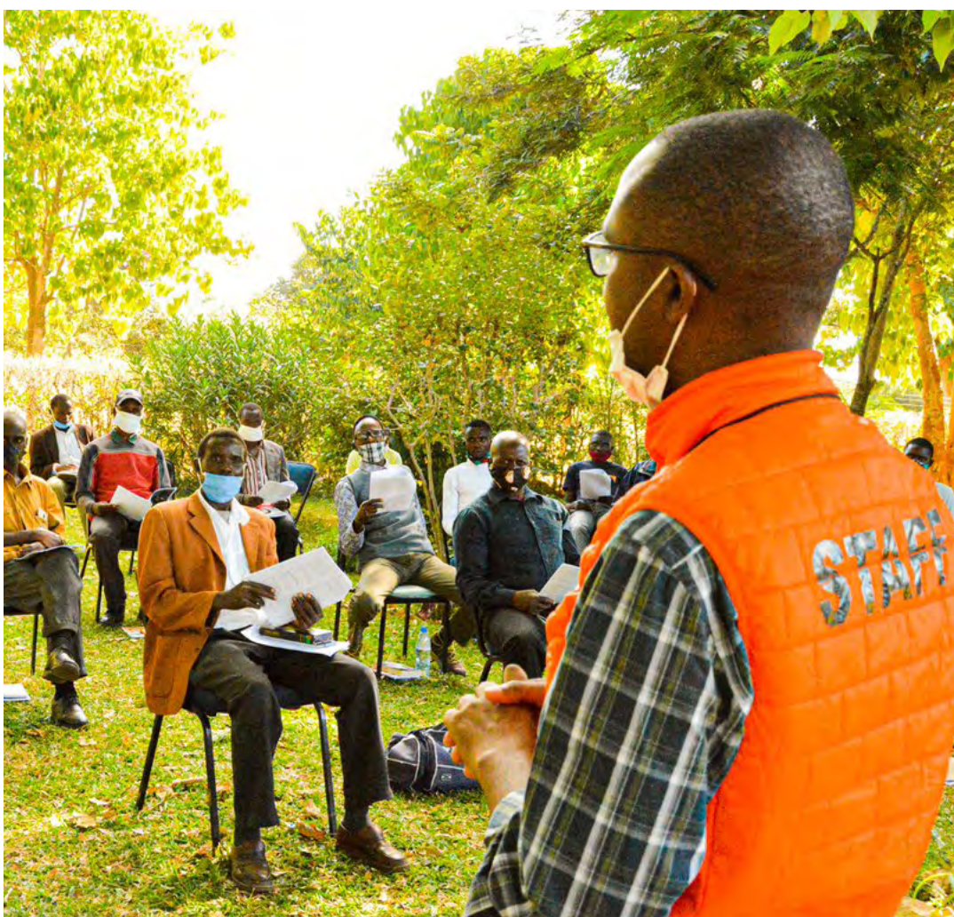
World Vision Zambia has partnered with faith leaders to create awareness on COVID-19 in communities where we work.