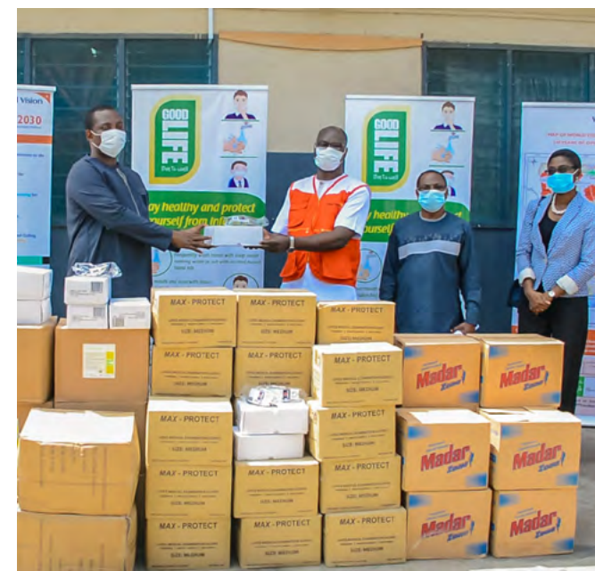
World Vision Ghana donating Personal Protective Equipment (PPE) to the Christian Health Association of Ghana.