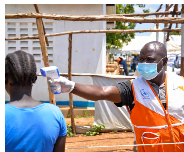
A World Vision staff in Bidibidi refugee settlement in Uganda checking the temperature of one of the beneficiaries before accessing the food distribution site.