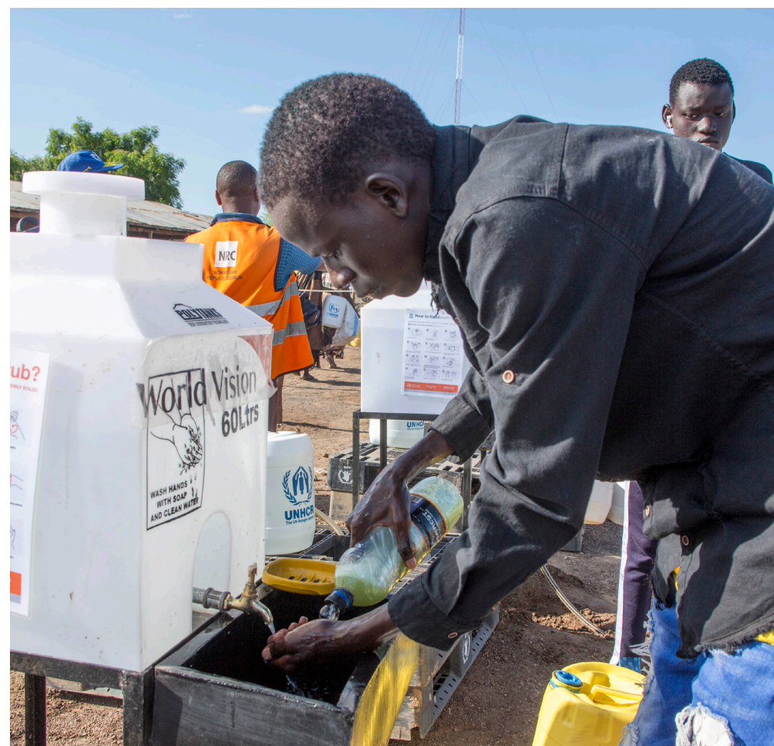
World Vision Kenya is promoting recommended hygiene practices and social distancing measures while distributing food to enhance the well-being of children and families at Kakuma Refugee Camp.