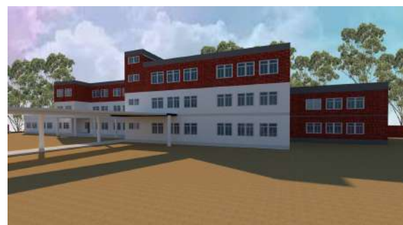
Phase 2 : Addition of One floor above the Secondary Block

To address high dropout rates amongst adolescent girls our solution is a world class facility to work with 320 adolescent girls to be named the Girl Icon Leadership Academy.