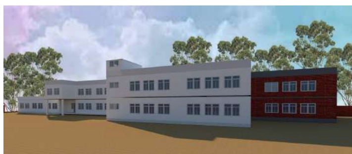
Phase 1 : Extension of Secondary Block