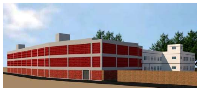
New Primary Block (Block A)

For the first need, our solution is to create a dedicated 26,598 Sq. Ft. co-ed primary school for 500 students from lower kindergarten to grade 5th. This will include classrooms, washrooms, staff rooms, Labs, Library and Play areas including furnishings.