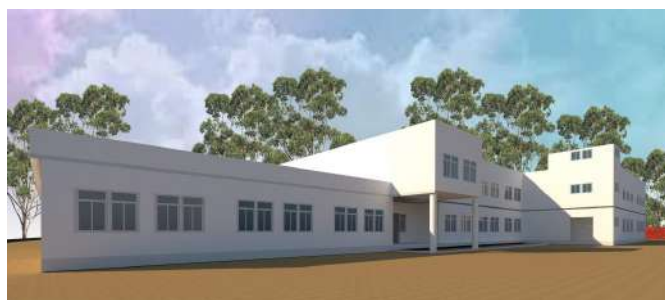
Existing School Building