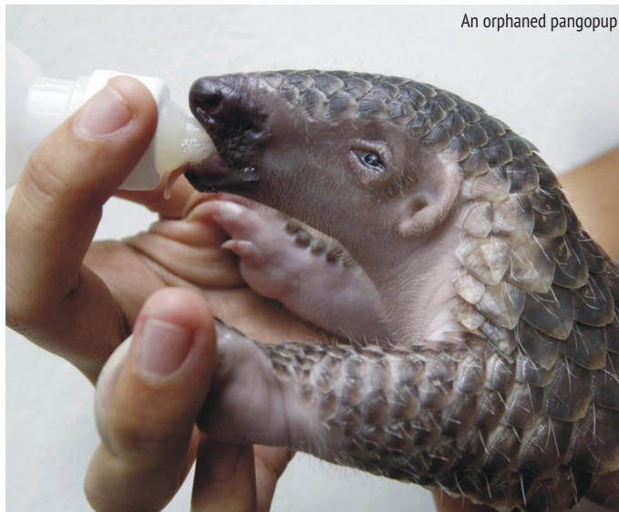
An orphaned pangopup

Though pangolins share many characteristics with anteaters, they're actually more closely related to carnivores like bears, cats and dogs.