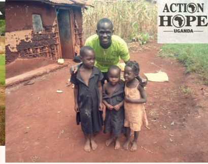
Orphans and the vulnerable children