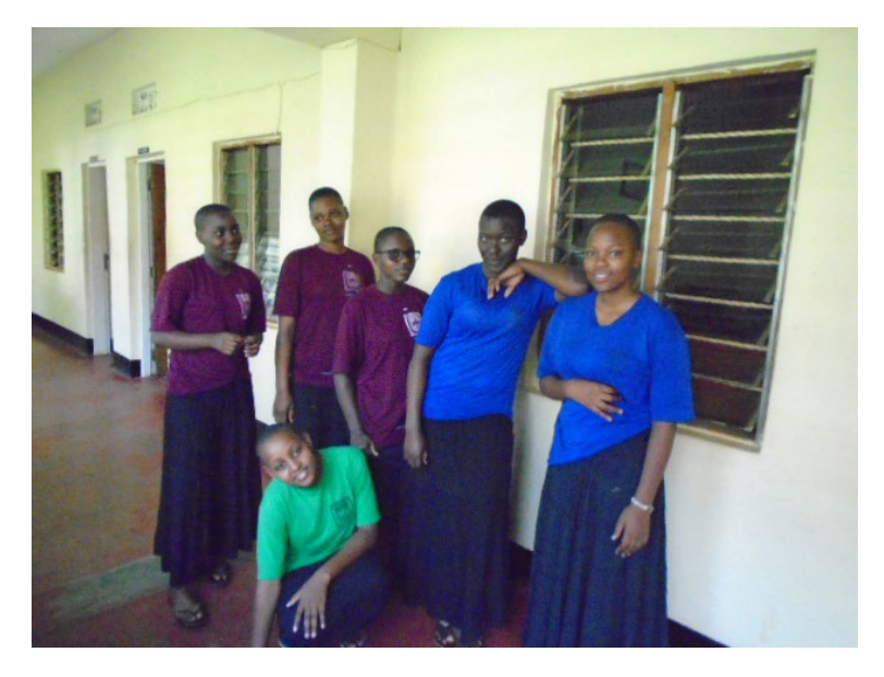
St Micheal Visitation

There are currently 3 Senior 4 candidates. Please keep them in prayer so they can sit for their exams without any trouble. We had other girls visited at School.