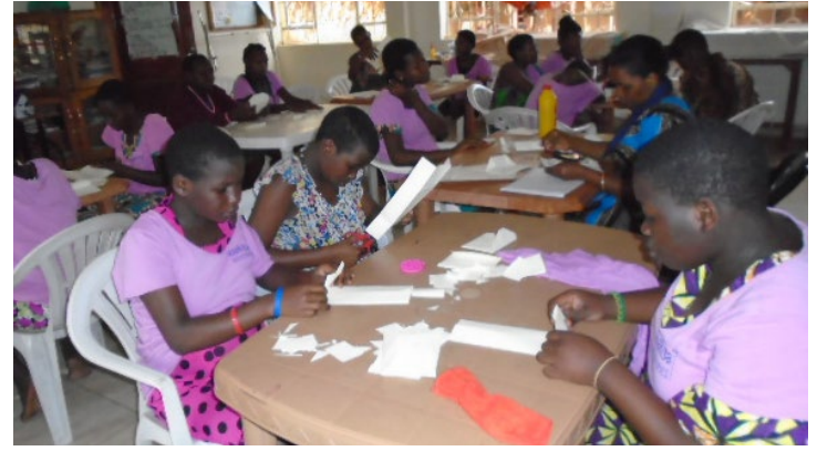
girls making envelopes