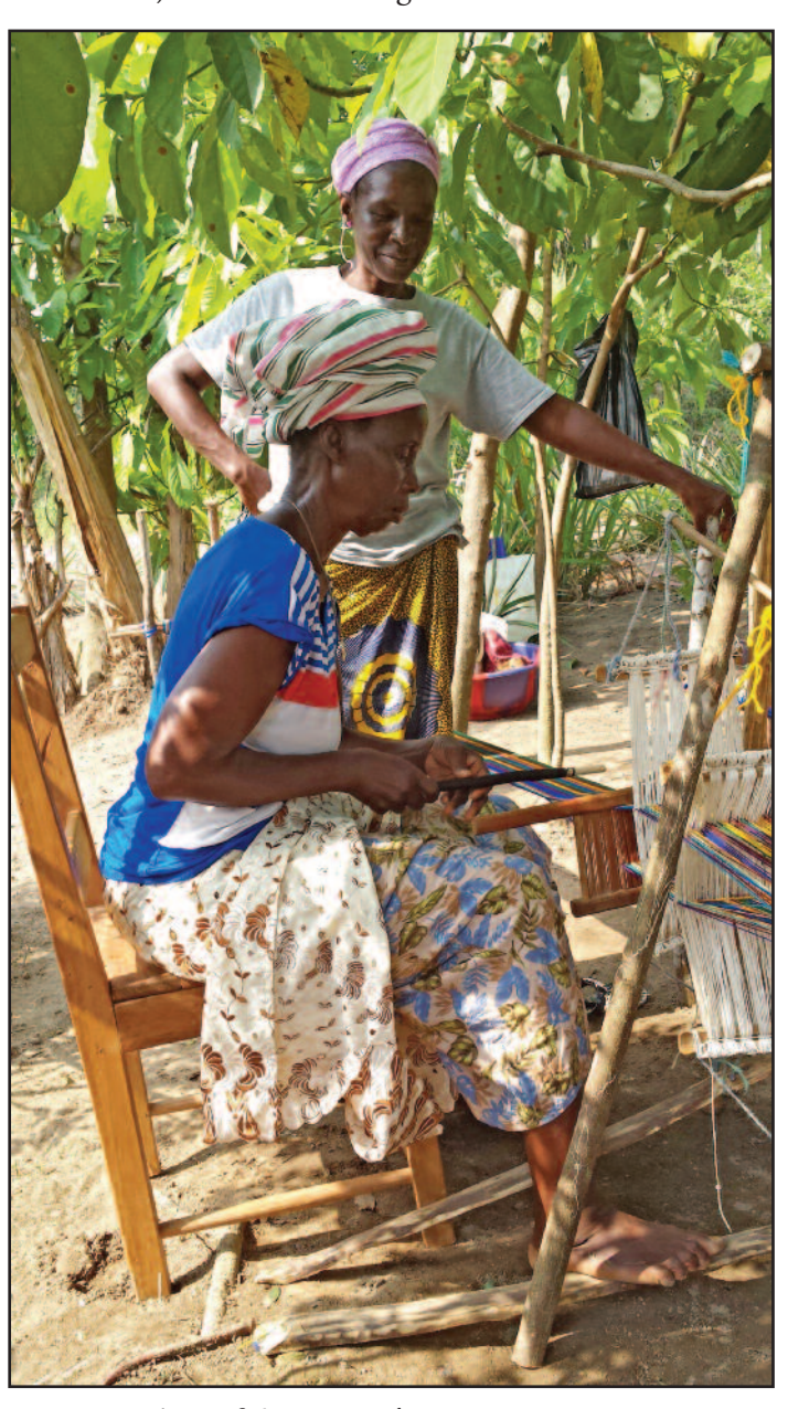
Members of the Women's Weaving Cooperative

RESTORE HOPE: LIBERIA is currently investing in its first economic development pilot project. The Women's Weaving Cooperative was established by our beneficiaries' caregivers themselves. With RESTORE HOPE: LIBERIA's support, the Women's Weaving Cooperative generates income from the members' traditional, artisanal weaving.