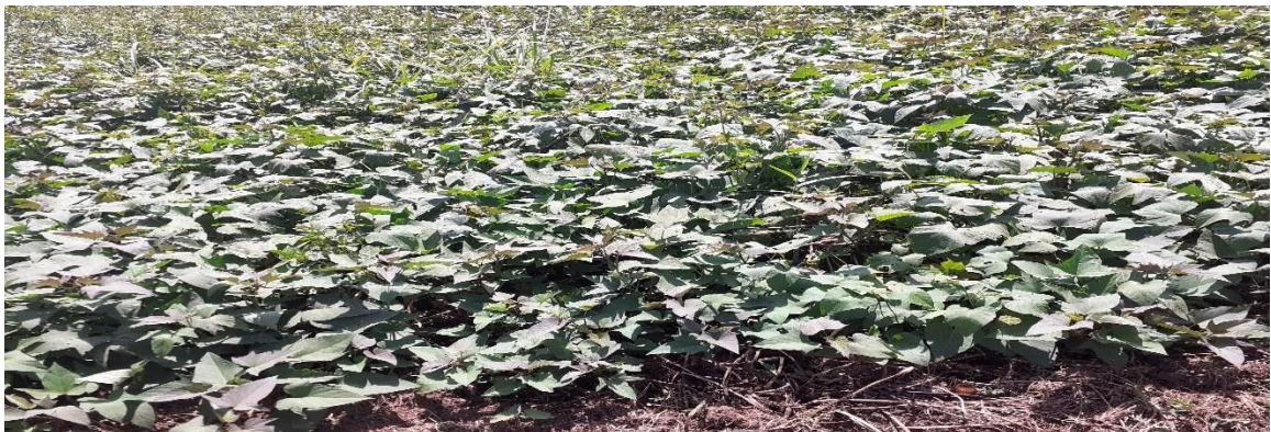
The garden of sweet potatoes is almost ready for harvest.