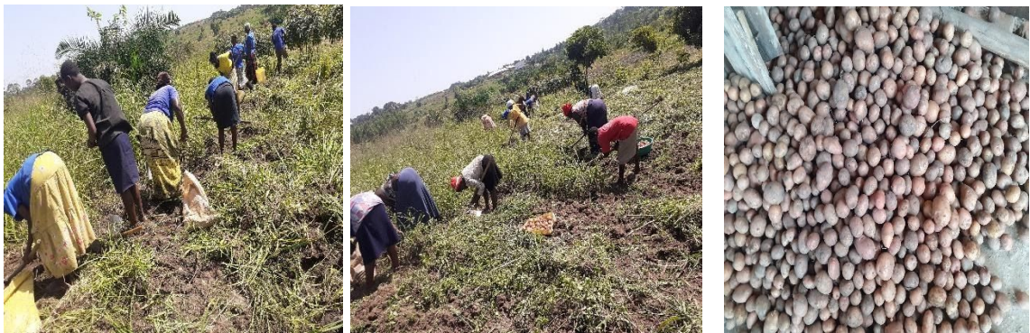
Parents harvesting Irish Potatoes on 29 January 2021