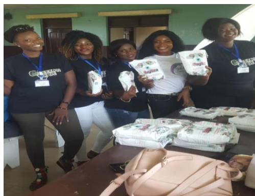
Sanitary pads donated to young girls at Bulu Blind Center on the international day of the Girl Child

In cognizance of the importance of a girl child in our society, DMF in partnership with African Pride and UNESCO Peace Ambassadors on the International Day of the Girl Child visited the Bulu Blind Centre in Buea, Cameroon and donated sanitary pads & lectured on girl's hygiene menstruation.