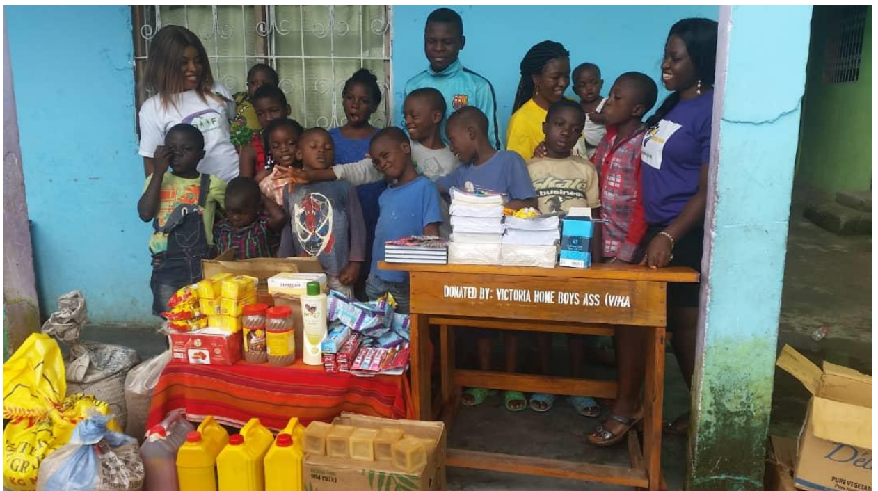
Donation Made to CAHECAM Orphanage

Henrietta Nkongchu Foundation to implement a charity project at CAHECAM orphanage in Limbe. It was quite an amazing event with thirteen kids of CAHECAM orphanage. The project has as its goal to help out the kids so they don't feel completely left out and grow to be valued members of society with a promising future. Educational materials were successfully donated to the kids to prepare them back to school, in addition, food items and toiletries were given to them to enable them feed well, grow healthy/strong and be motivated to study. Moreover, the children were advised to uphold good morals as they interact with one another and equally educated on basic hygiene and sanitation as core to living a healthy life.