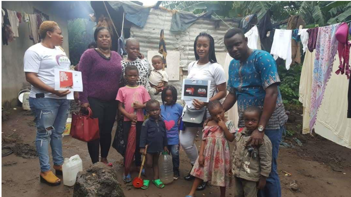
Mandela Day Humanitarian Assistance Drive

Mandela Day calls on us all, every day, to make the world a better place. The message behind Mandela Day is simple – everyone has the ability and the responsibility to change the world for the better. If each one of us heeds the call to simply do something good every day, we can live Nelson Mandela's legacy and help build the country of our dreams. In commemoration of Nelson Mandela's International Day, Denis Miki Foundation engaged in a Humanitarian Drive project activity designed to provide humanitarian assistance by Non-Food Items (NFI), Food Items, Health Insurance, small and medium enterprises start-up capital to identified vulnerable individuals in Limbe and around the South West Region of Cameroon. This was done through door-to-door distribution of gift packs to vulnerable people in vulnerable neighborhoods of Limbe.