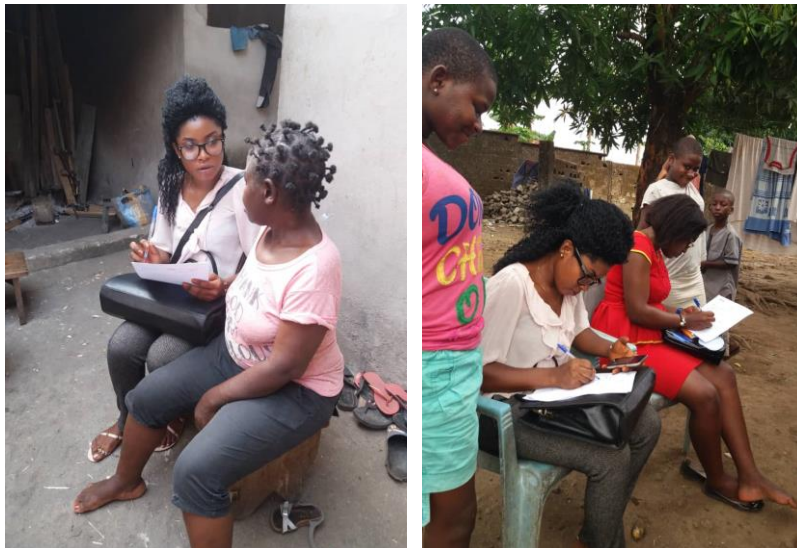
Registration of internally displaced widow and children

Due to the socio-political upheavals hitting the North West and South West Regions of Cameroon, we have influx of internally displaced men, women and children in the city of limbe who're in great need of assistance. It's based on this premised that in the month of February DMF in partnership with the Danish Refugee Council engaged in the registration and need assessment of these IDPs in the city of Limbe