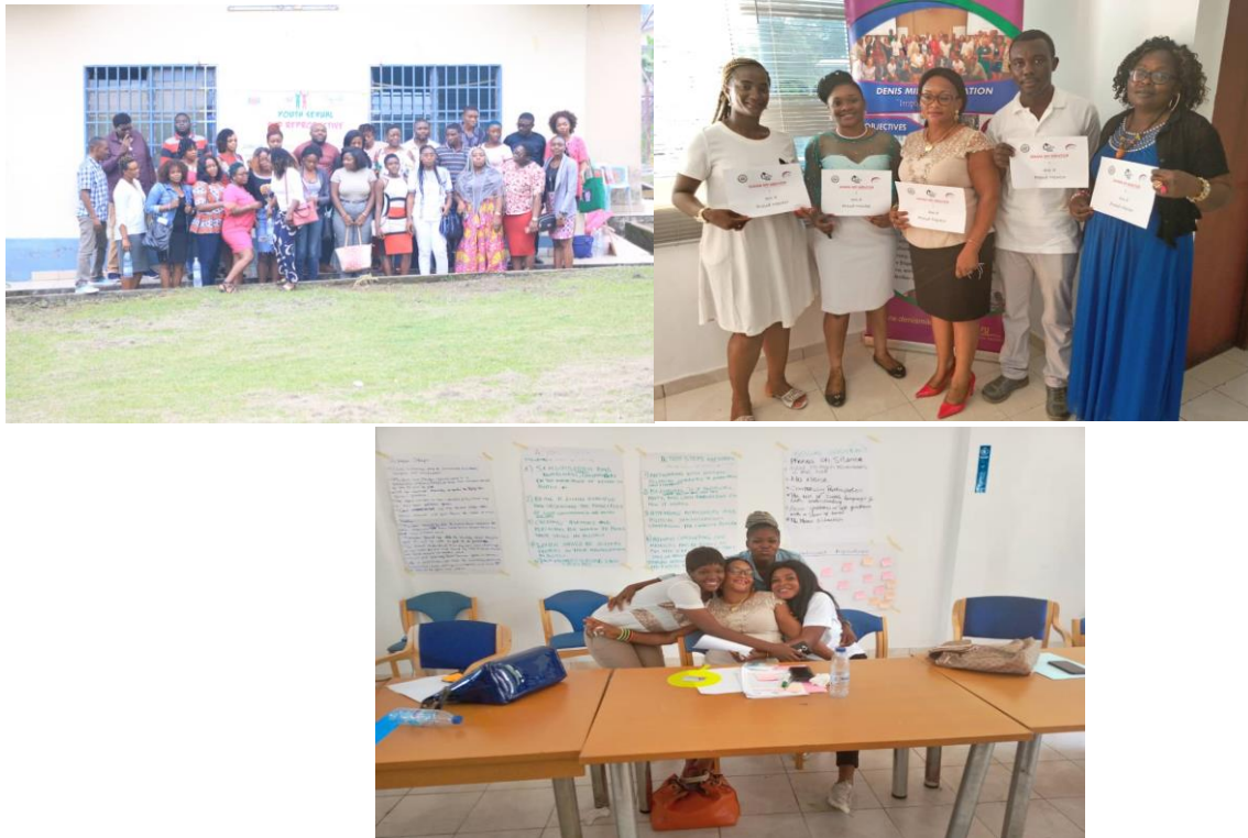
Young Girls Spending an Amazing Time with Their Mentor