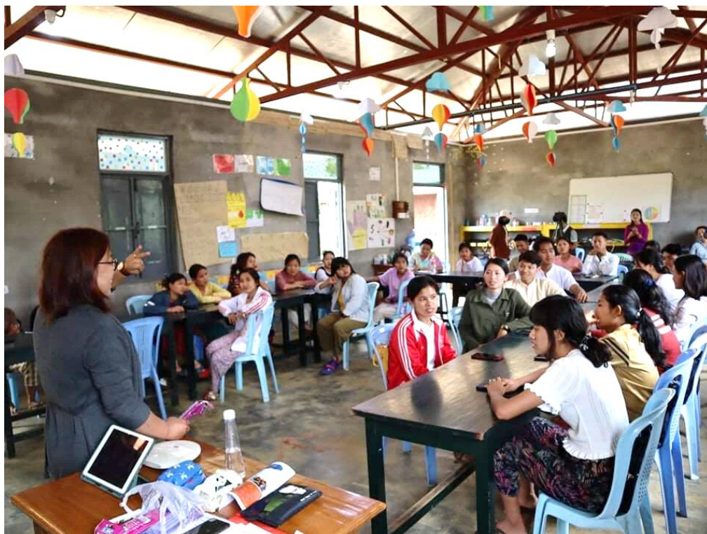
Teacher training at NSi