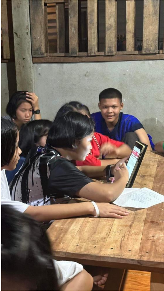
School children explore MyLibrary at Maw Paw Khoet.