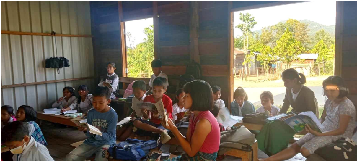
Middle school students at the learning centre in Cikha

In September 2023, we launched two new initiatives. Raise a Hand is a new project funded by Monde par la Main which will set up new eLibraries at two off-grid locations in rural Kachin. Ready to Learn will build on the 2021 pilot scheme in Chin State with an expanded learning centre in Cikha and a new learning hub in Putao.