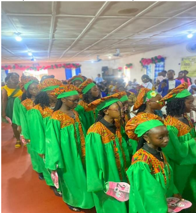
6 th grade graduating class marching into graduation program

The school held its second graduation exercise on July 9, 2023. Thirty-one girls successfully passed from the kindergarten (14) and 6 th grade (17) divisions. Three students received double promotions from the six grade class to eighth grade class based on their excellent academic performances. Also, a total of 83 girls made a successful pass at the end of last school year. 56 girls dropped out during the last school year due to lack of money to settle school fees and complete their academic school year.