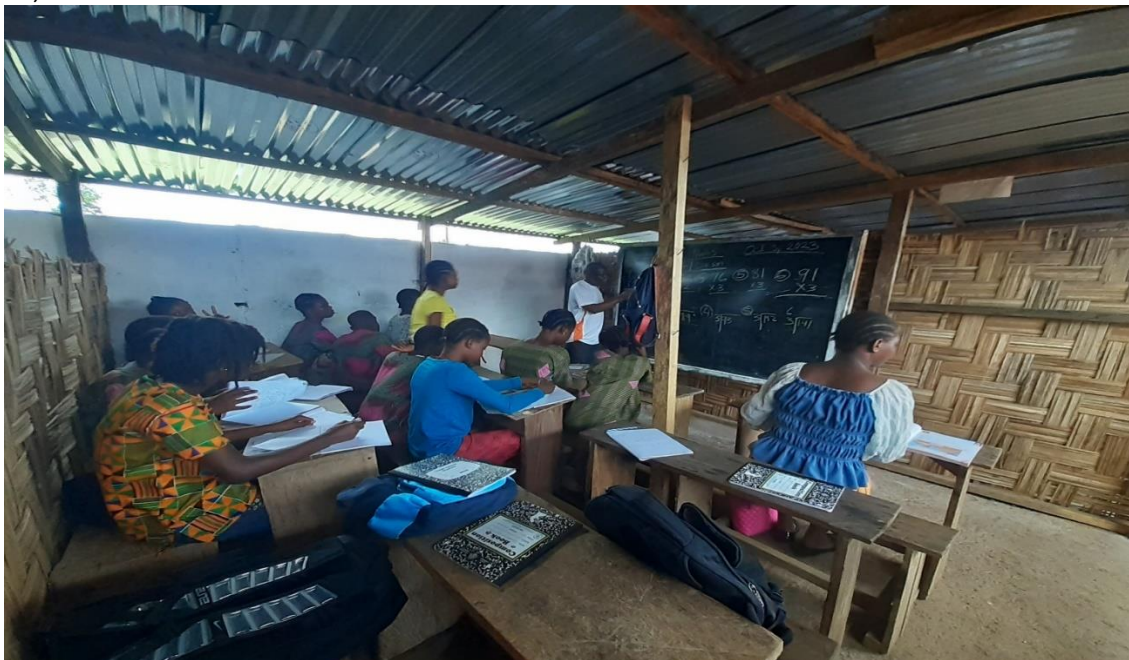
Grade 4 class

On September 21, 2023, we commenced the official academic school year with registration still open so as to allow other kids, whose parents have not had them registered due to fear of elections violence, to complete their registration after elections. A total of 150 girls pre-registered. Currently, 102 girls have started classes while we expect more registration of students after our country's national elections which is slated for October 10, 2023.