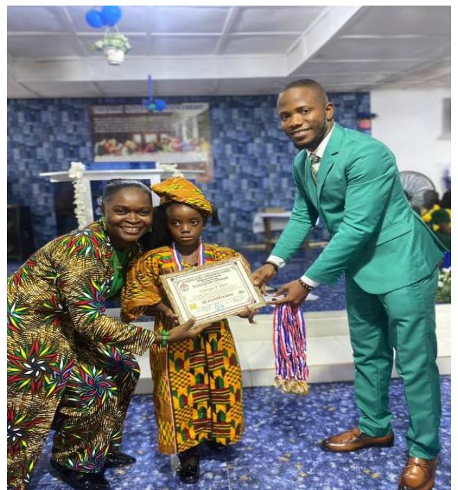
Kindergarten graduate being certificated