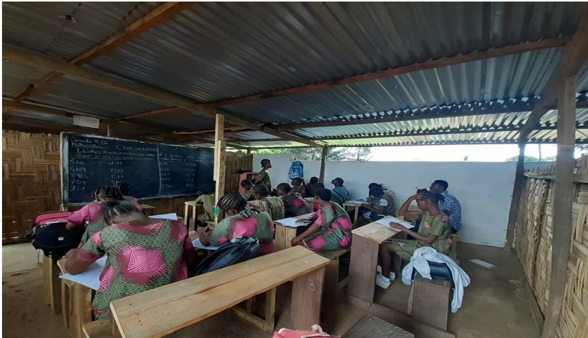
Grade 6 class

New renovation and extension work has been completed to accommodate the ninth grade class. All other classes have been fully partitioned to avoid distractions from other classes. This will help improve the classroom environment for both teachers and the students.