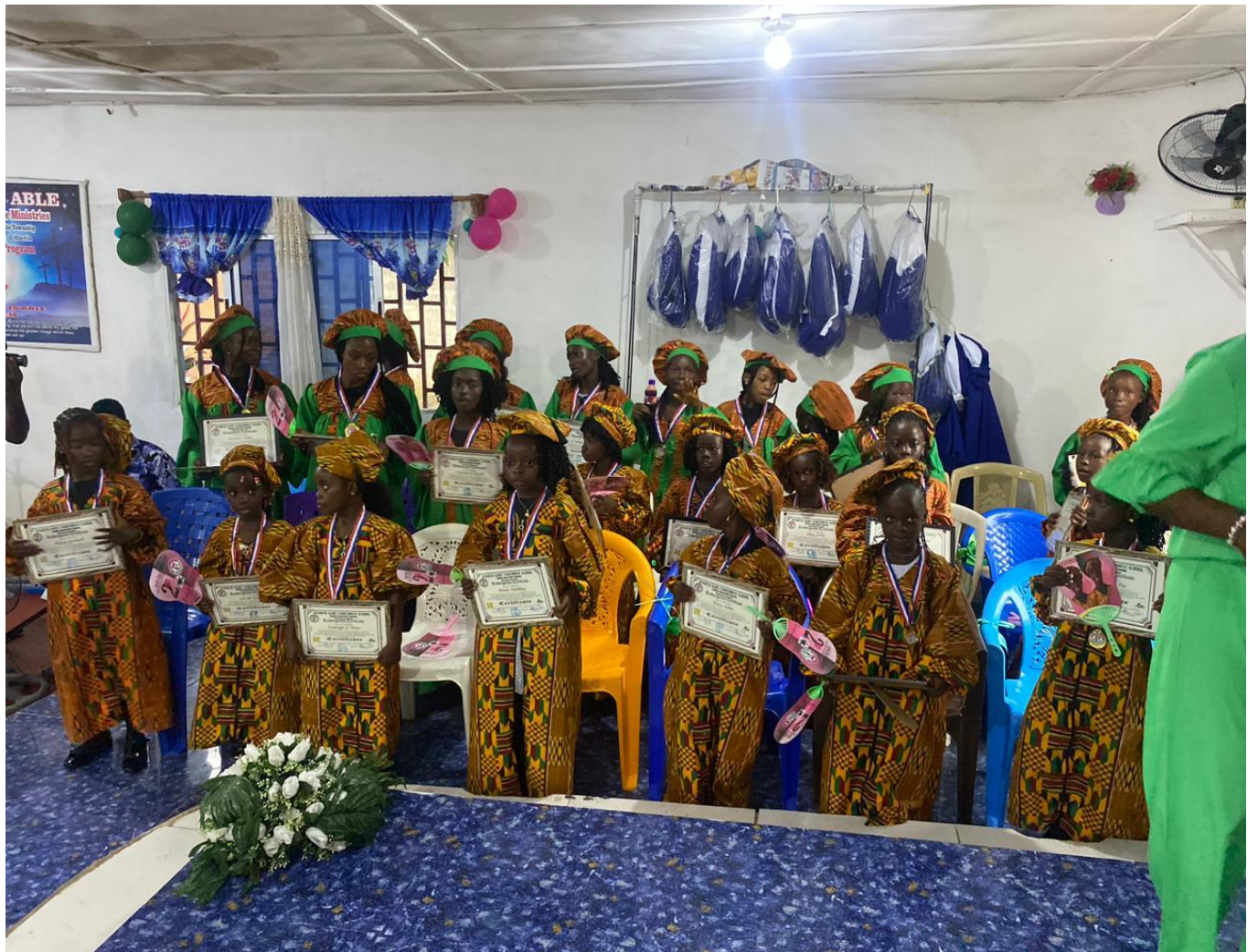
Full view of kindergarten (Yellow Kente gown) and six grade (Green & Kente mixed gown) graduating classes