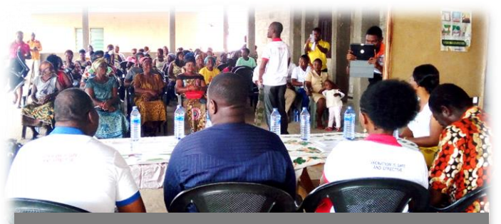
Engagement with communities and stakeholders

TFD recognizes that the empowerment of women and disadvantaged people requires an innovative combination of social, education and economic approach to help them achieve independence and self-sufficiency. This program aims to give women in precarious situations, young women who have dropped out of school and teenage mothers access to social microfinance, vocational training, improved farming practices, training on how to prepare briquette as alternative charcoal fuel - a well-paid environment-friendly profession.