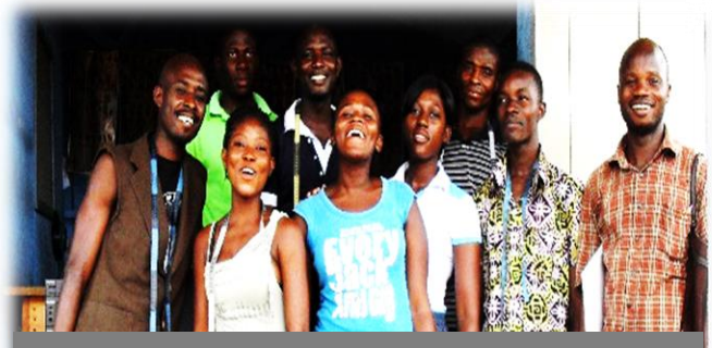
Outreach education programs with out-of-school youths