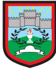
Kamenicë Municipality for Highest Impact in Volunteerism