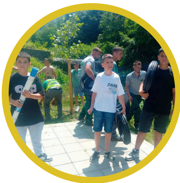
Super-Volunteer Club "Dituria", Suharekë