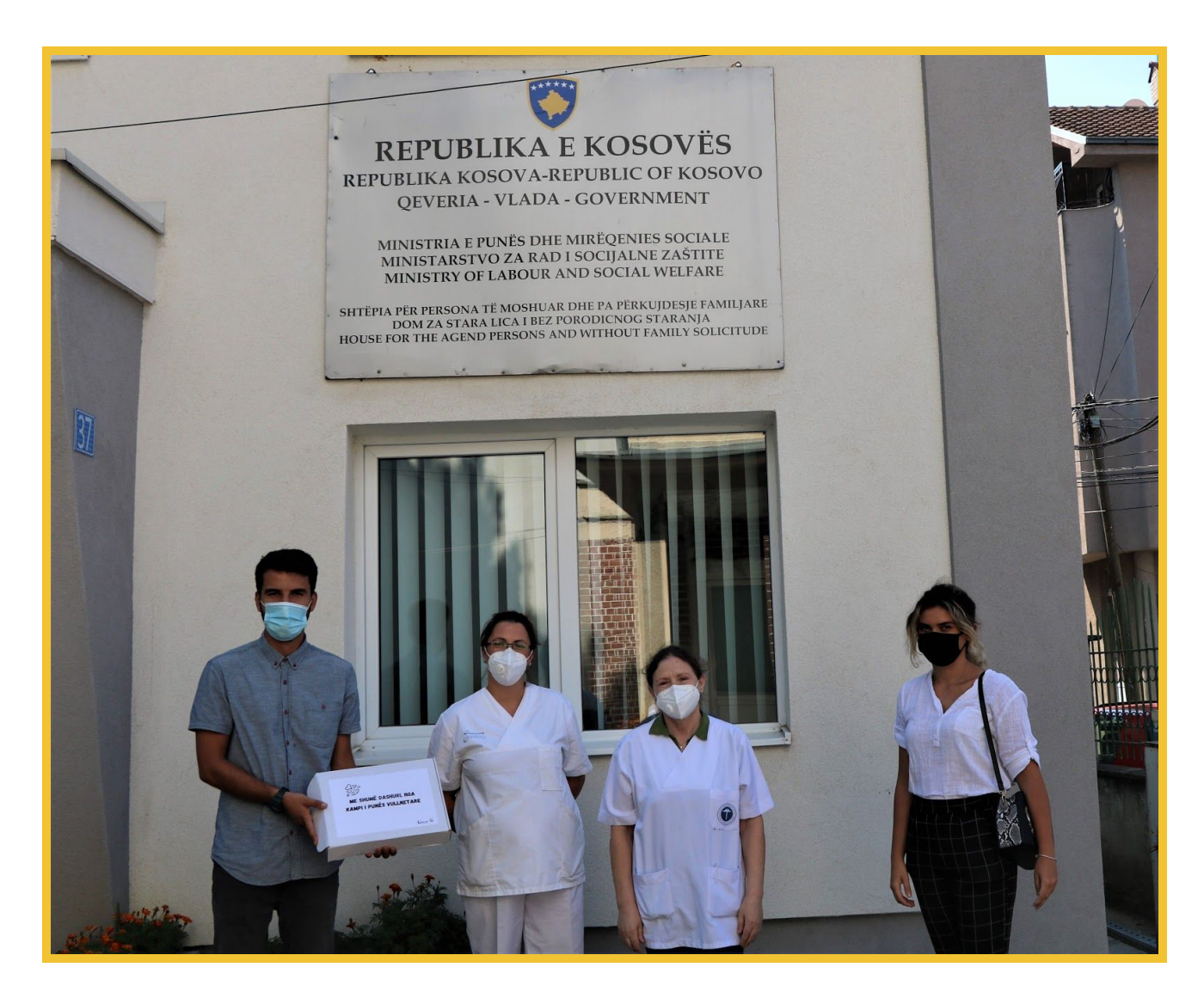
TOKA donating +200 masks from the Volunteer Work Camp 2020 to the Home of the Elderly in Prishtina.

Volunteer Work Camp : This camp developed the skills and abilities of 40 participants who are part of the Super-Volunteer clubs. One of the projects was creating over 200 protective face masks which they donated to the Home of the Elderly in Prishtina.