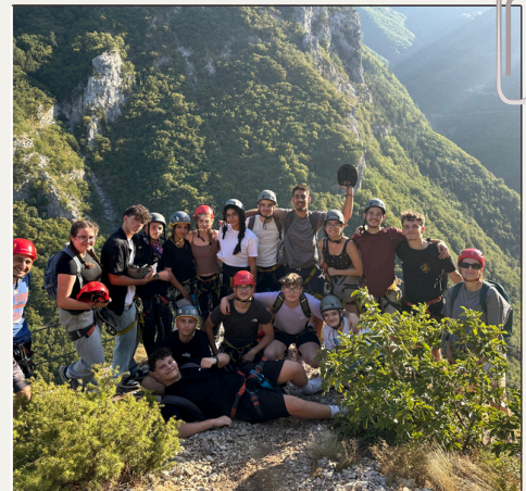
International PeaceBuilding Camp

As part of the learning outcomes, participants collectively produced a poetry booklet reflecting on identity, war, love, and hope, as well as an impact report documenting the camp's results.