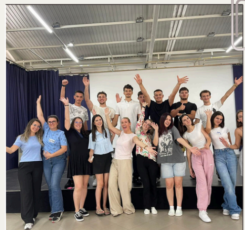
2 Employment Training Camps

Participants also received post-camp mentoring, including online follow-up sessions to finalize CVs and motivation letters, improve interview skills, and identify and apply for relevant opportunities. As a result, 13 participants applied for internships or employment, and 5 were successfully placed, demonstrating the camps' positive impact on youth employability and labor market readiness.