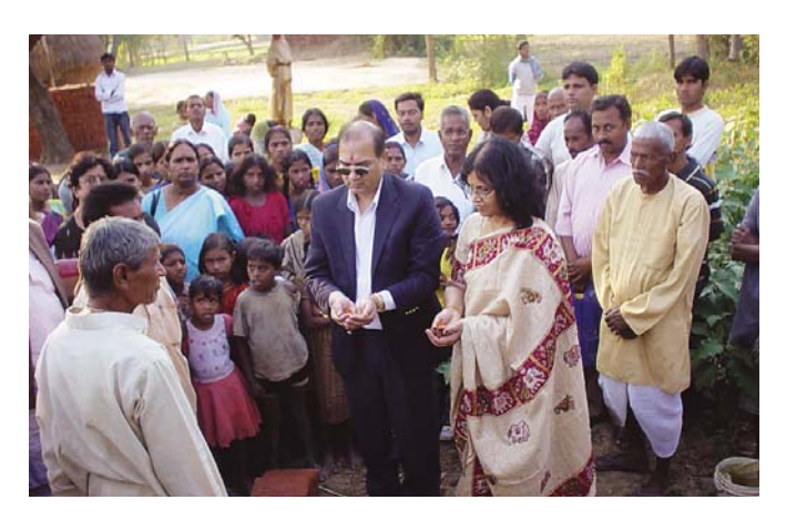
such camps once a month. Apparently Nirnaya's direct monitoring of village initiatives has resulted in remarkable change.

Nirnaya hopes to upgrade the play school at Gomahar with each passing year. The children have been given uniforms. It is heartening to witness the difference that the school has made in these children's lives. They are more disciplined as they reach school on time and can now say a prayer by themselves. This school will follow the Vikasini syllabus and lesson plan and eventually the unit test and examination system followed by any mainstream school as per the CBSE syllabus. A batch of twelve women completed the tailoring course and has voluntarily stitched school uniforms for the village children. The success of this course has seen thirty women being enrolled for the next course. Another heartening piece of information is that the three Self Help Groups (SHGs) formed have managed to collect Rs.8000 which was deposited in the cooperative bank. Some of the women have undergone training in making pickles, jams and fruit squash but need to hone their skills if marketing of these products is to take place. This is an area Nirnaya would help in. As there is no auxiliary nurse and midwife the A&C Kumar Family Foundation through Nirnaya is sponsoring two women for training - one as a paramedic and the other as an auxiliary nurse and midwife. Medical camps for the area are also on the agenda as doctors have already committed to holding