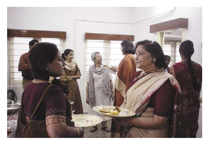
grow and some of those present promised to start putting in time for this work. The delicious lunch and camaraderie were the best way to ring out the old and ring in the new year.

In the latter half of the financial year Nirnaya has made 10 new grants towards marginalized women's advancement in different parts of India. Simultaneously, the capacity building of the grantees will also take place so that there is critical reflection, peer learning and setting of success indicators for subsequent benchmarking. We recognize the fact that we have to make our work tell the story and also generate measurable impact indicators. This learning we are passing on to our grantees so that women are recognized as being able to make their case.