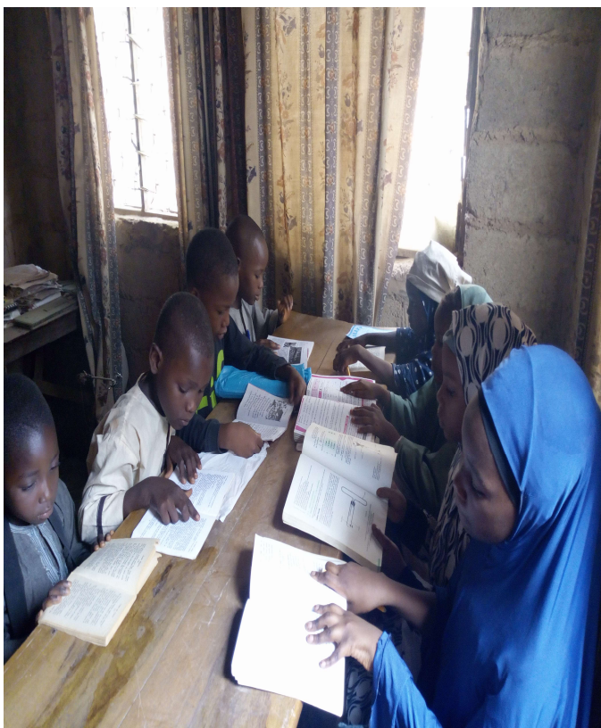
Pupils Preparing for Reading Competition at BASU Community Library

Bakin Ruwa community is generally considered to be an educationally backward partly because most of the residents are more inclined to trading. Indeed a research conducted by BASU reveals that 65% of Bakin Ruwa community students do not have text books and only 1 out of 10 reads a single book in a year, 50% fail exams at different levels. Moreover, 45% of the primary pupils can not read and write and 40% of the secondary students can neither peak nor write a sound paragraph in English language. While only 20% are computer literate.