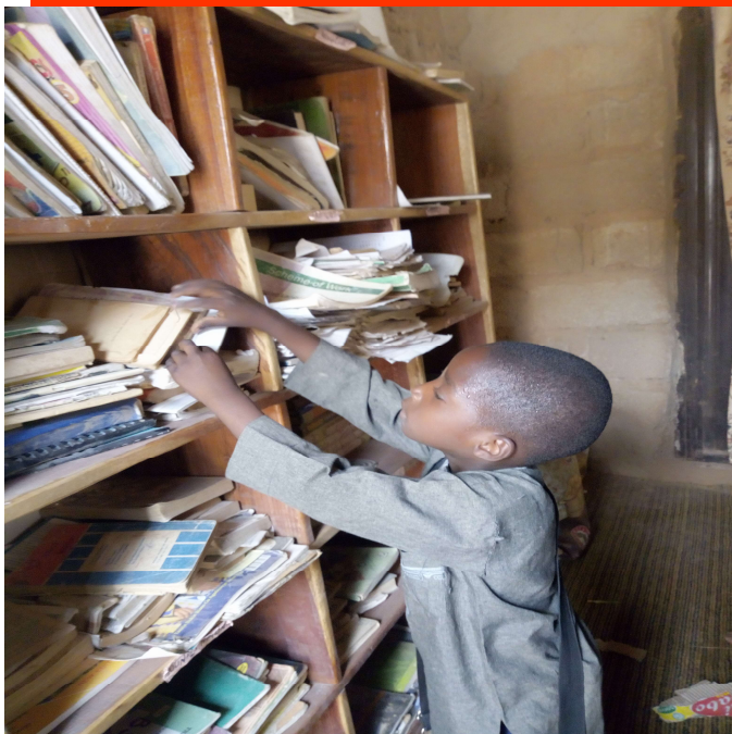
A Primary 2 Pupils Taking book from the shelf of BASU Community Library