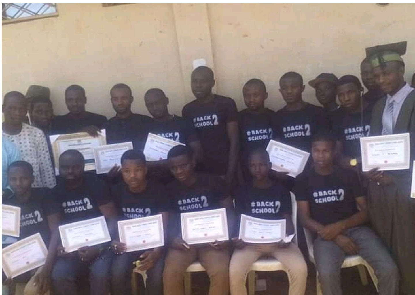
Members of the Bakin Ruwa Students' Union (BASU) during BACK TO SCHOOL CAMPAIGN which intends to reduce the rate of out-of-school children and promote literacy.