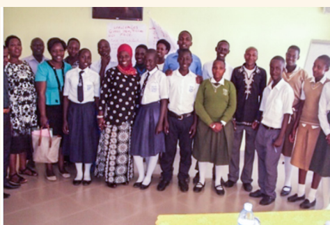
OCE trains adolescent peer Educators from sec. schools