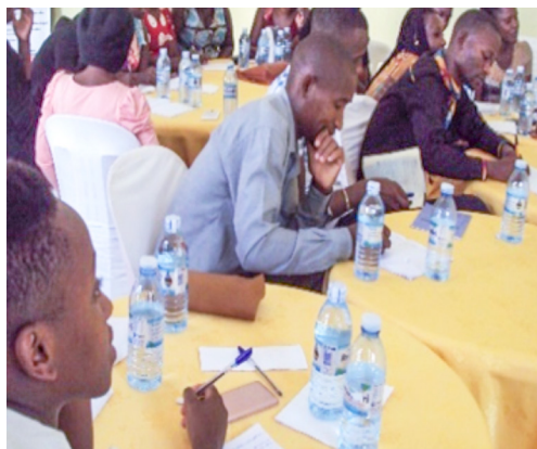
Peer Educators among key populations in a training