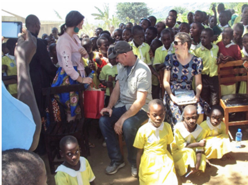
Brodke family from USA visits Kaliiro Primary school where a purifying system for safe drinking water has been installed