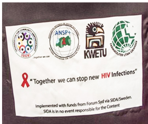
Partners under cross border HIV project