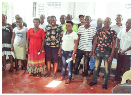
Bar & Lodge managers after a sensitization meeting