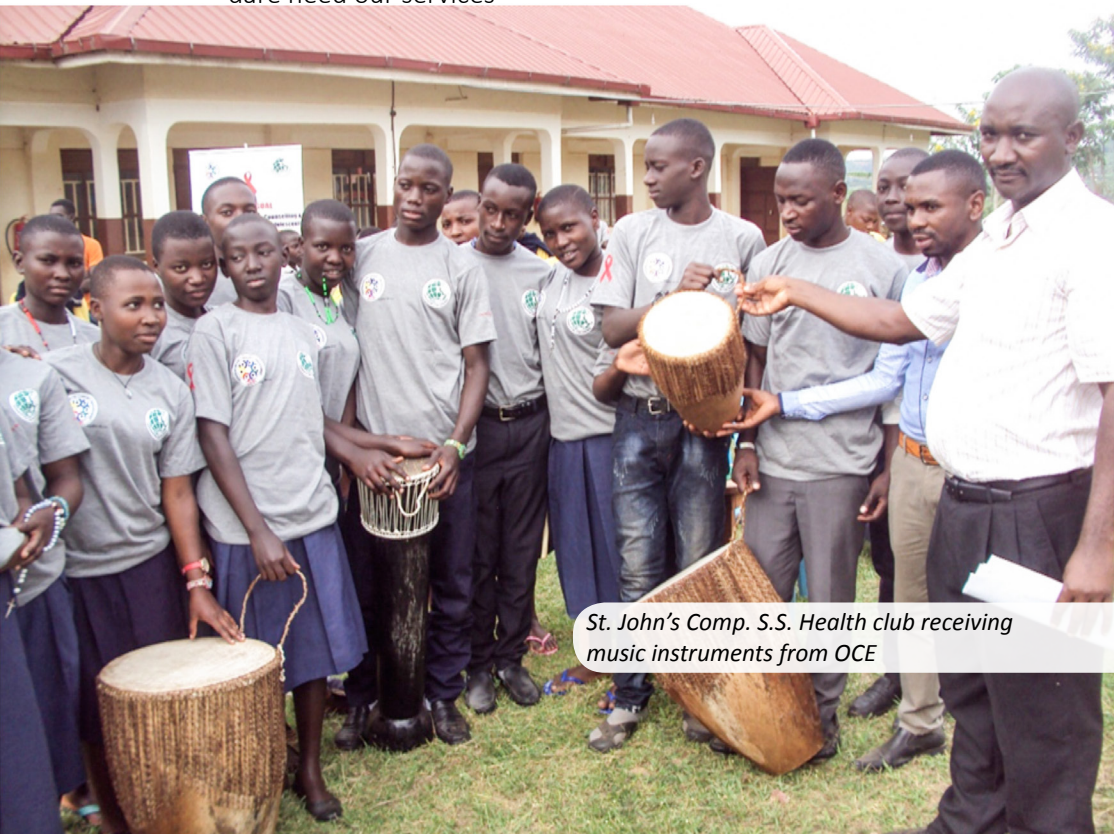
St. John's Comp. S.S. Health club receiving music instruments from OCE