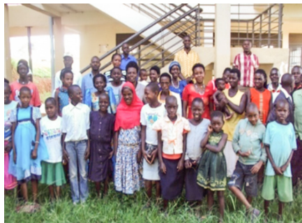
Adolescents during a Health camp for sharing experiences