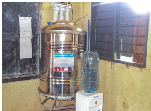
An installed safe drinking water purifying system at Kaliiro P/s