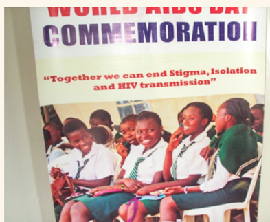
Adolescents' message in the fight to end HIV new infections