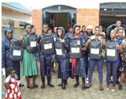
The facilitated peer educators among key populations

Sensitization meeting held with Bar & Lodge Managers on use and installation of condom dispensing boxes. It was discovered that most of the upcoming lodges in hot spot areas of key populations do not possess condom dispensing boxes. They also noted that there was need for continuous condom education and sensitization. The lessons learnt and best practices from this pilot project will guide OCE, ANSP+, FUG/KWETU on the development of a bi National HIV & AIDS combating project in Lyantonde and other districts along Rwanda – Uganda cross border high way.