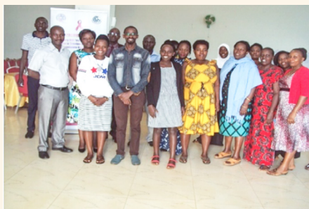
Health workers during a refresher training