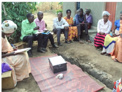
VSLA members during their meeting