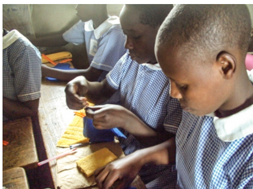
Adolescent girls from Lyantonde P/s during RUMPS training