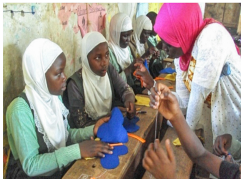
Adolescent girls from Kyabbuza Primary school being trained in menstrual hygiene & how to make RUMPS