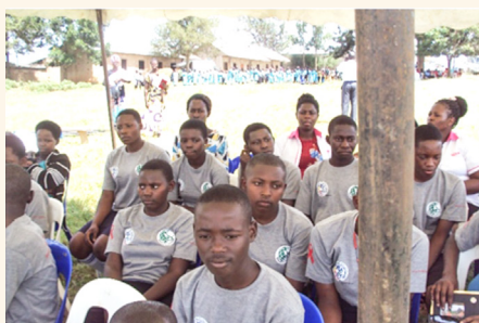
School Health clubs at the forefront in HIV prevention