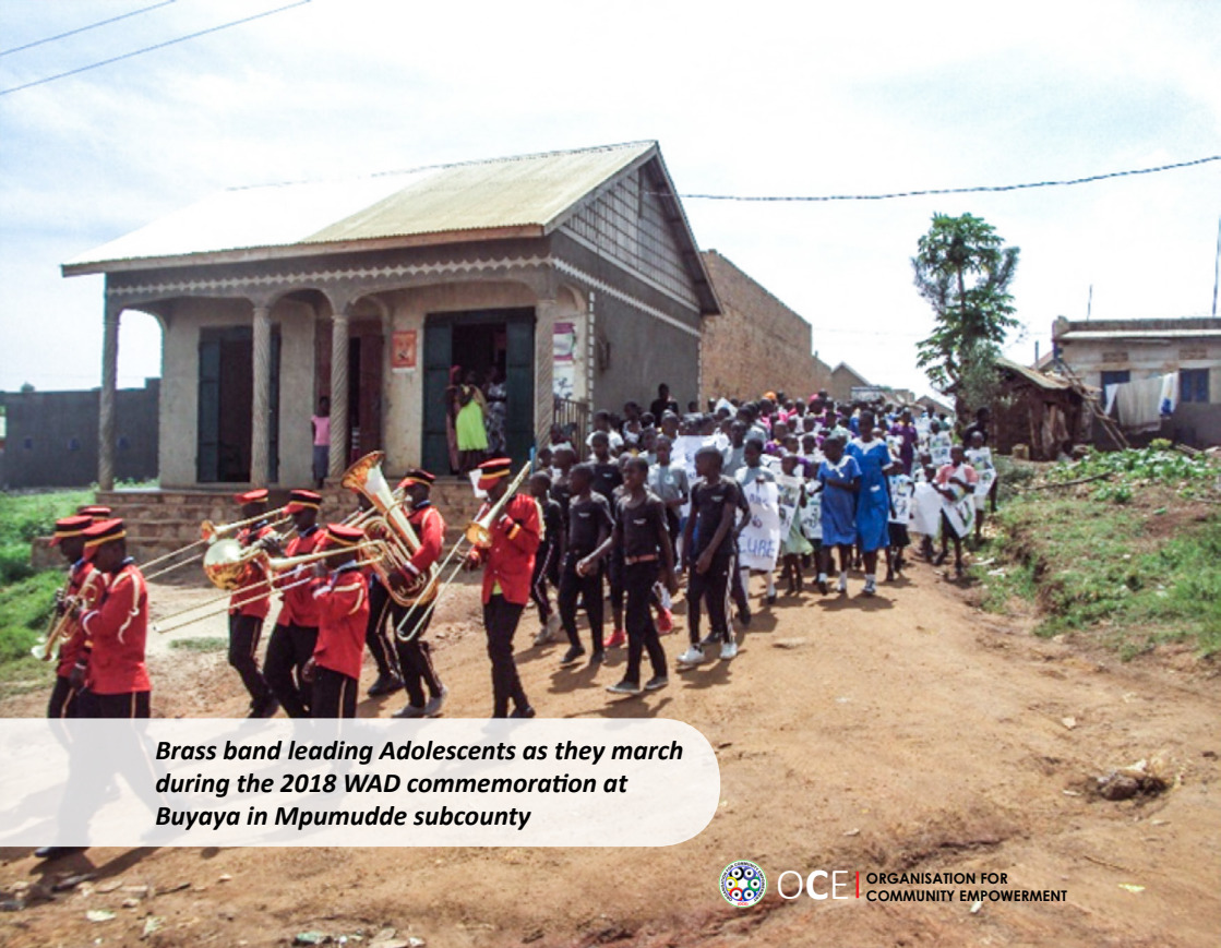
Brass band leading Adolescents as they march during the 2018 WAD commemoration at Buyaya in Mpumudde subcounty