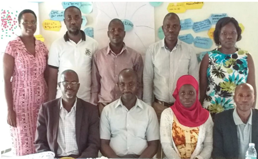
OCE Board & Management Team during a capacity building & learning training workshop in Dec.2018

OCE conducted a 3 days' workshop for Management and Board members focused on roles and responsibilities for each, good governance and building capacity of the team to effectively run the Organisation. The knowledge and skills acquired during the training is hoped to be used to increase on the efficiency, effectiveness and sustainability of OCE geared towards achieving its goal.