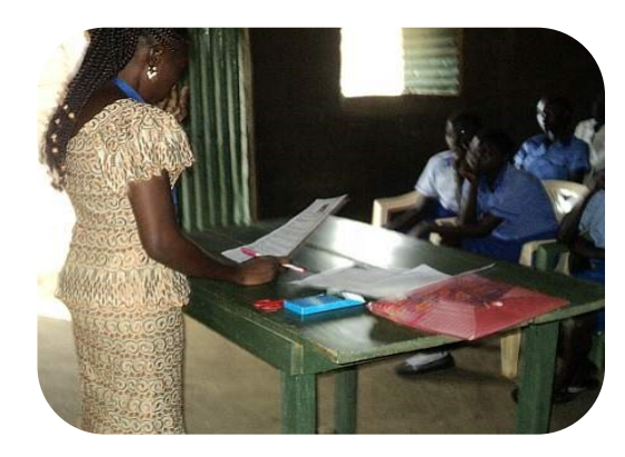
IDO's Education officer during sensitization

Achieve resilience by enhancing active participation of community members in developmental and community service programs.