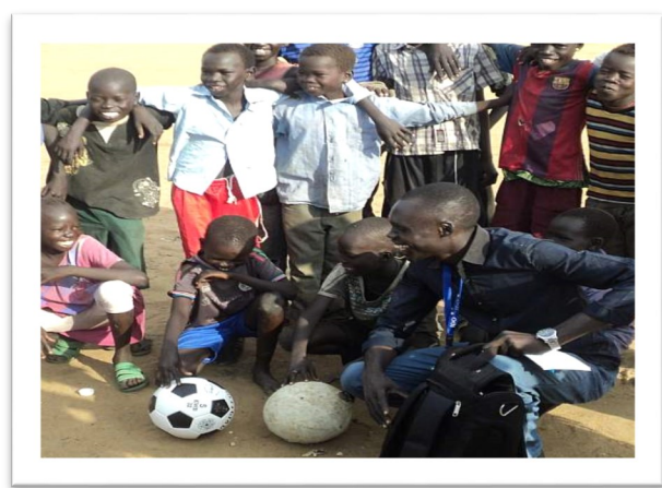
Happy street children after receiving new footballs from IDO