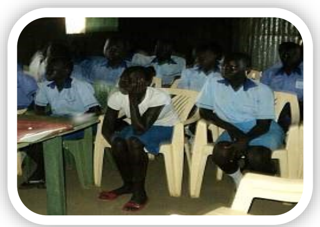
Pupils listening during adolescence awareness session conducted by IDO