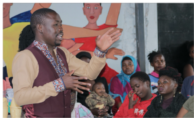
Consultative meeting with parents for the new dance floor plan.

Firstly, project elimu believes in sustainability of the communities we work in, therefore as a policy the first vendor priority are given to parents of our students and the wider Kibera community. With this we have experienced a sense of ownership of our centre from our parents and the wider community.