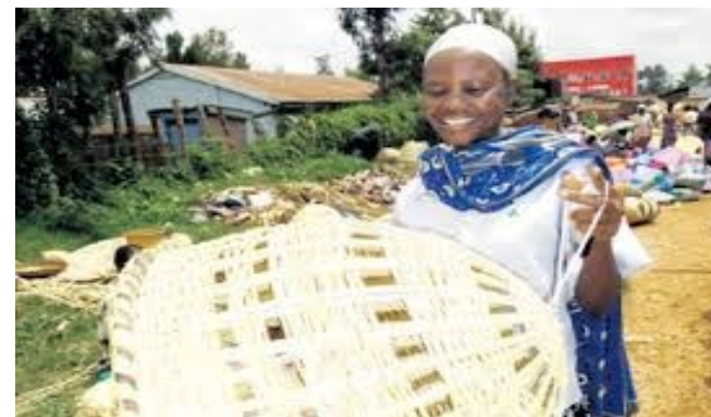
Improving Household Income through Basketry