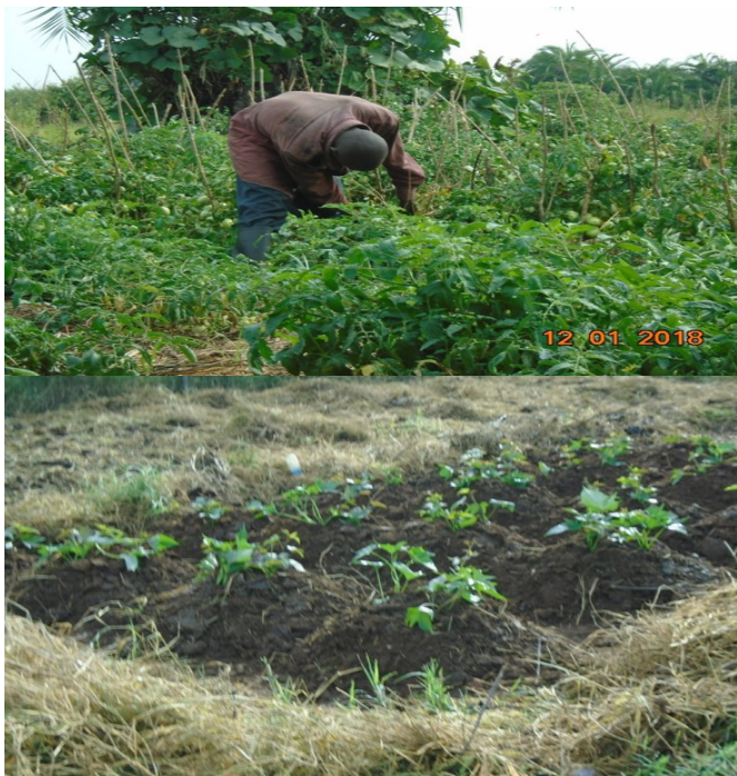
Promoting home Gardening

This program addresses challenges facing poor households in having adequate food and income for their livelihood. It supports trainings on appropriate farming methods, supply of certified seeds and improved poultry. It also promotes nature based enterprises (NBE) mainly Basketry, bee keeping and fish farming . We also support trainings in Business skills, Village saving and Loaning (VSL) Scheme and providing seed money to groups of needy households for VSL scheme. To date, the program has supported training of 200 households on appropriate farming methods, and 7 CBDs on Business skills and VSL..