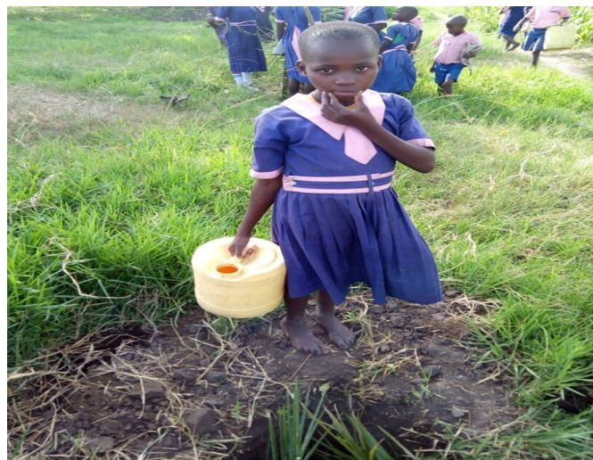
Tree planting to mark World environment Day 2017 at Buongo primary