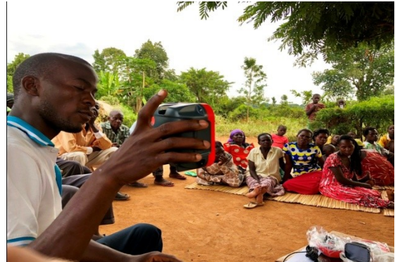
Our Executive Director showing a solar light to community members

"Pearl Entrepreneurs Academy" is a grassroots non-profit organization improving health and education in the rural areas of Uganda through the last mile distribution and financing of renewable energy products solutions. We replace dangerous, kerosene lanterns with solar lanterns using sustainable, clean, safe and reliable energy. We began rural village savings and loans Associations and we continued to work in partnership with other local NGOs and CSOs to distribute and donate solar lights to school children in low income families.