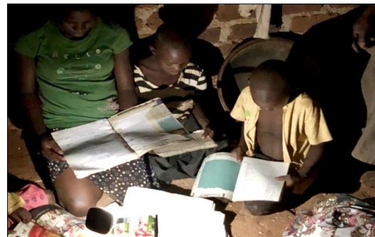
One of our beneficiary school children

We are currently devoted to a region in eastern Uganda where over 80% of the rural population has no access to electricity. In January 2019, we launched our solar light project, in which we will distribute over 10,000 solar lamps in 12 months of this project in partnership with Abatuuka Foundation, a local NGO with a proven record of lasting change and Wilmot development foundation a national NGO.