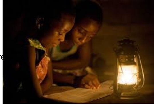
Example of children reading on a kerosene lamp

Roughly half the Ugandans today live in rural areas with no electric connection at all. These families have no reliable light source to use at night. Those who can afford it use kerosene or gas lighting, which clog the environment with dangerous fumes and causes different human diseases.