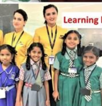
Learning how an airport operates.