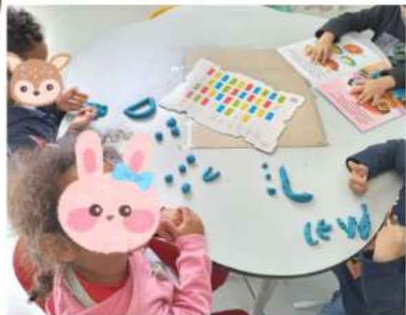
Image 4: Children creating alphabet in braille with the use of modeling clay and doing readings with children's storybooks in braille. All materials, from understanding LEGO® Braille Bricks.

A typical Brazilian party, celebrated in all Brazilian states. The party is celebrated on three (3) dates in the month of June. 13 (Santo Antônio) 24 (São João) and 29 (São Pedro).