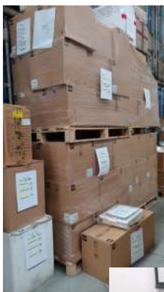
Images 5 and 6: Sample of LEGO® Braille Bricks kits being prepared in São Paulo to be sent to the municipalities located in the southeast, midwest, and northeast of the country.

A total of 1887 kits were distributed to 23 municipalities in 3 states. 350 schools received the kits.