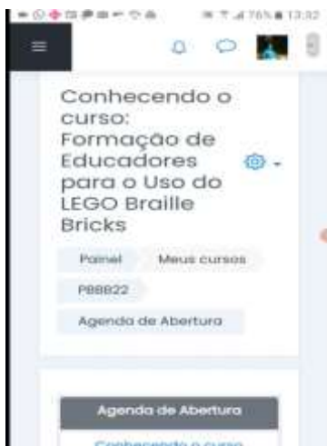
Image 1: Left: Image presenting the navigation of the virtual environment with the title: Getting to know the course: Training Educators to Use LEGO® Braille Bricks.