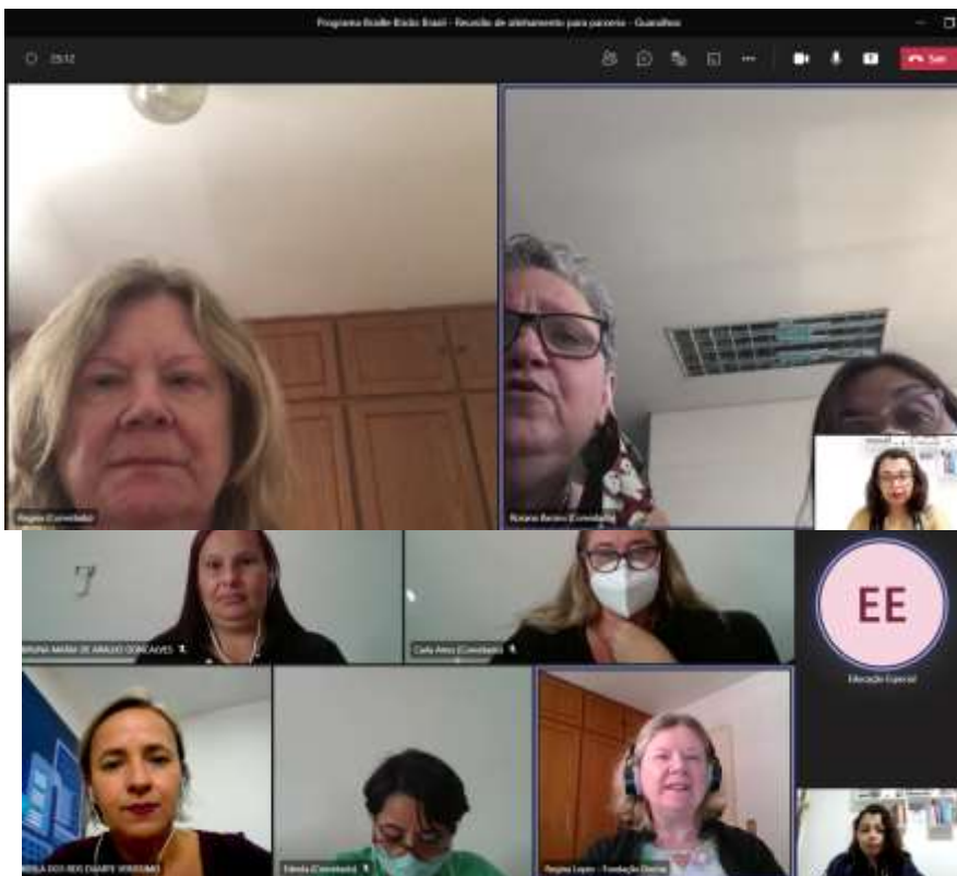
Image 8: online meetings to establish partnerships with the municipalities.