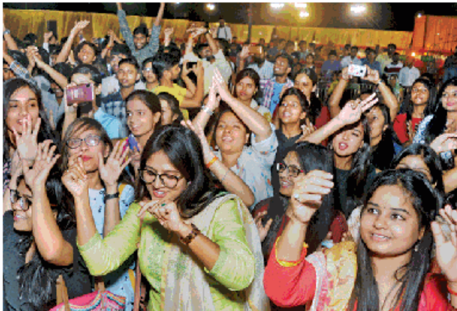
मैनावती मार्ग स्थित इस्कान मंदिर हुए इवाल्फ कार्यक्रम में रॉक बैंड पर हरे रामा हरे कृष्ण धुन पर झूमती युवतियां