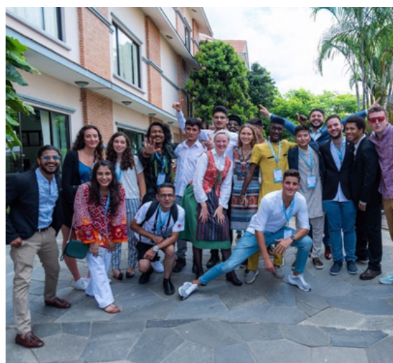
Delegates dressed up for Opening Ceremony.

For the 2019 Summit, we found support from the Nepal Government and the provincial Government of Gandaki, as well as Visit Nepal 2020 and the Film Development Board of Nepal. A record number of UN agencies sponsored our young delegates, including UNESCO, UNICEF, UNRCPD, UNDP, UN Women, and UNFPA. In addition, hundreds of private donors gave through TIME and the Global Giving Campaign to ensure that delegates with passion and vision, from every economic class, could participate with the Summit this year.